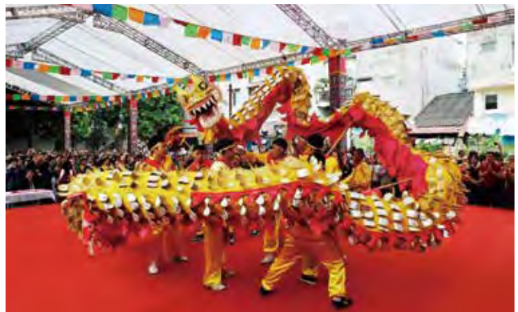
White Manjushri initiation and Refuge Vows at Chùa Phúc Khánh Yên Viên Buddhist Temple