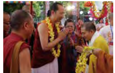
Fire Puja and Refuge Vows at Chùa Súi Buddhist Temple in Hanoi