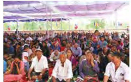
Rinpoche conducting the Vajrakilaya ritual