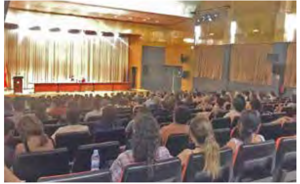
Tara initiation and teaching on 'The Benefit of Mind Training', Lisbon