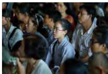
Medicine Buddha initiation at Trúng Hau Pagoda