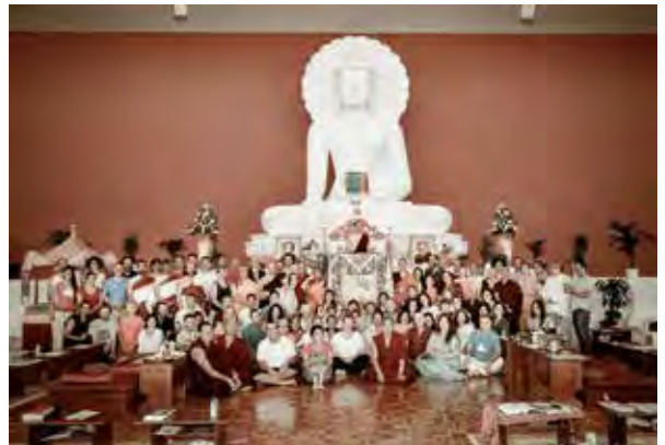
Precious initiations and teachings at Fundación Sakya, Spain