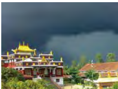
New Phodrang at Sakya Dhamchos Ling