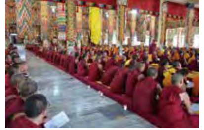
Sera Jey Monastery