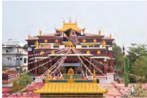
Tsechen Do-Ngag Choeling

Gaden and Drepung monasteries. This was followed by the conferral by His Holiness of the Jung-Due initiation upon a throng of several thousands of followers.