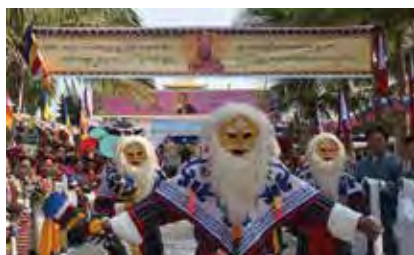
Monastics and community members welcome His Holiness to the Doeguling settlement