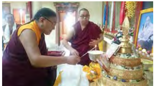
His Holiness lights the butter lamp at Tsechen Chokhor Ling