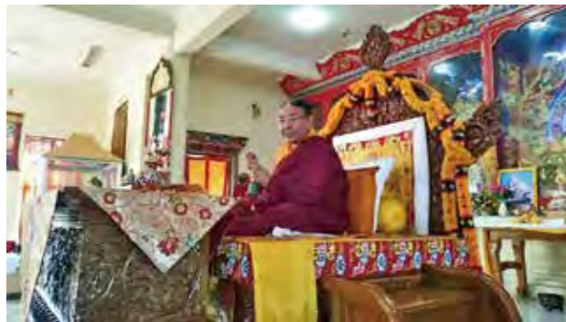
Powa for the public at Chokhor Ling

And so, after nearly a month of relentless activity, His Holiness returned to His residence in Dehradun, leaving behind him countless numbers of devotees who had been blessed and replenished by His presence.