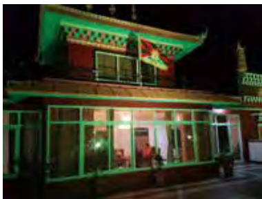
Tsechen Dhamchos Ling temple