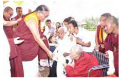
Visit to Dzongkar Choede Monastery in Hunsur