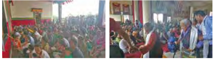
Blessings at Tsechen Chokhor Ling

Beginning with the bestowal of blessings by His Holiness to the thousands of avid followers who had flocked to Tsechen Chokhor Ling to pay their respects, the following days were filled with religious activities.