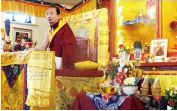
Guru Rinpoche empowerment at Sakya Thupten Ling, Bournemouth