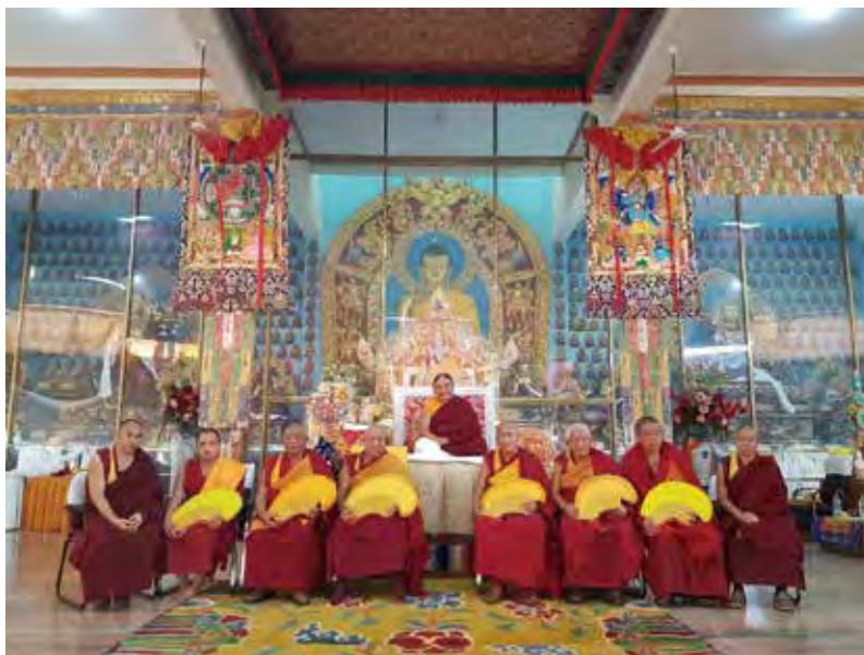
Drepung Lachi Monastic Centre for Advanced Learning