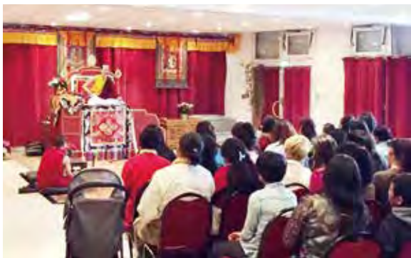
Green Tara initiation in Paris