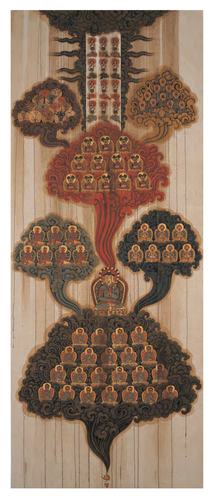
Figure 9. Mushroom Cloud No.2 by Gadé; mixed media on canvas, 248