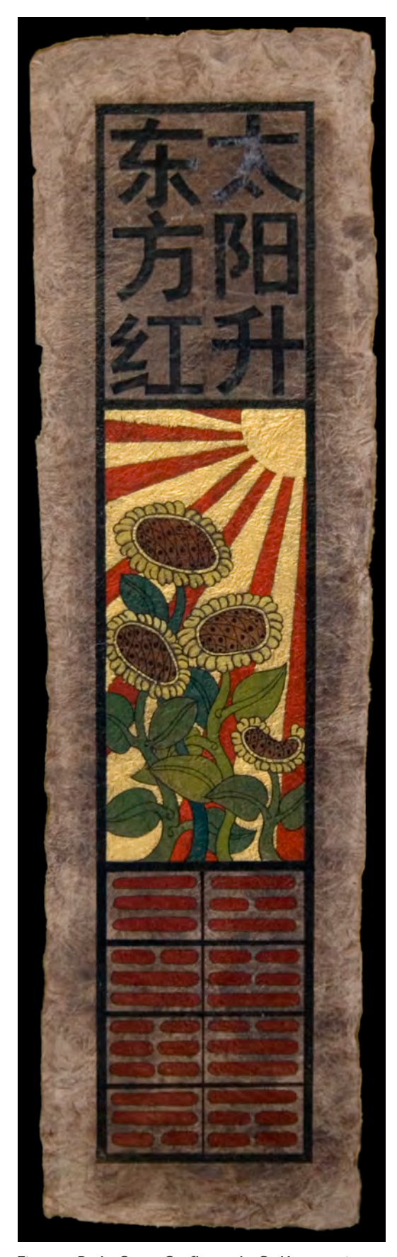
Figure 5. Pecha Sarpa: Sunfl wers by Gadé; stone pigments, ink, gold on handmade paper.