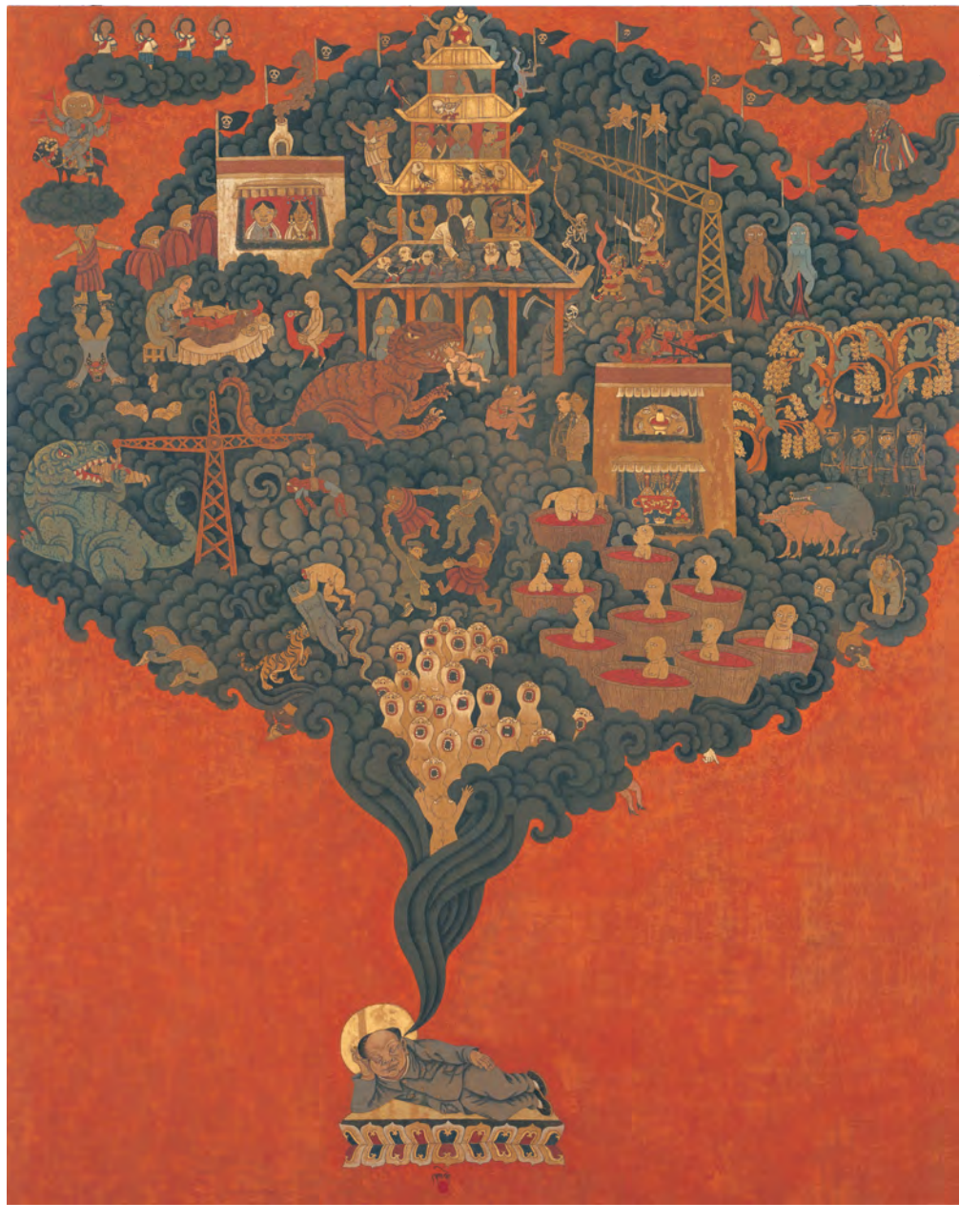
Figure 1. Father's Nightmare, by Gadé; mixed media on canvas, 146 x 117cm.

This raises an important question: What might 'Tibet' look like without religion? For many, Tibet is associated first and foremost with the religion and imagery of Vajrayāna Buddhism. Since importing Buddhist scholarly and contemplative lineages from India, Tibet's history and culture became thoroughly enmeshed in and expressed through an intricate system of Buddhist arts. In addition, the Buddhist art of Tibet has constituted material access to Tibetan culture for outsiders for centuries, and this trend continues through museum exhibitions and international art dealers. The centrality of Buddhism to Tibetan culture is thus integral to Tibetan, Western, Chinese, and other Asian constructions of Tibetanness. Gadé's painting does not 'look like' what viewers have come to expect of (Buddhist) art from Tibet.