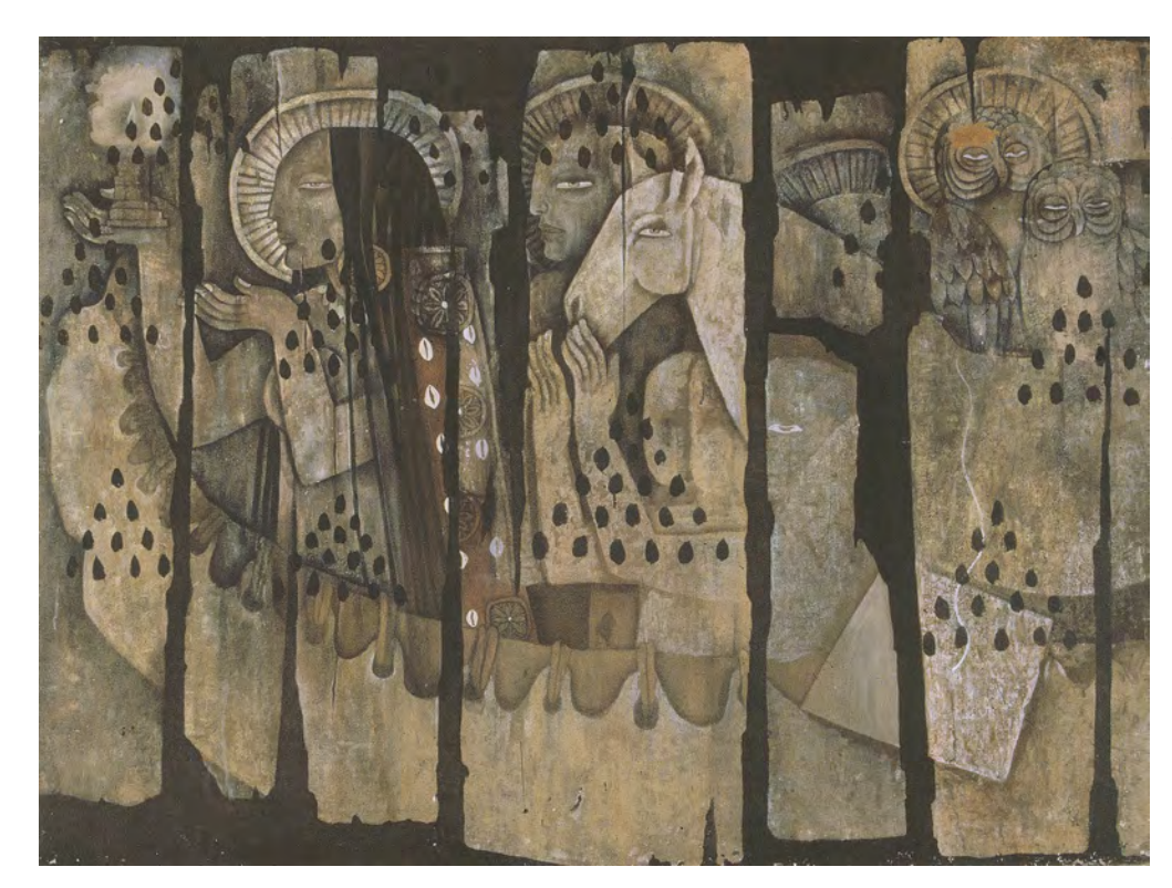
Figure 3. Spirit Beings on a Yak Hide Raft (detail) painted by Gadé in 1997; mixed media on canvas, 158 x 119cm.