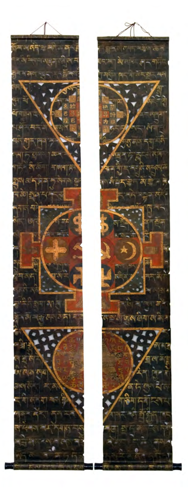
Figure 6. Pecha Nagpo [Black Scripture] by Gadé; mixed media on handmade paper, 191 x 30 cm.

Compared to the religious genre of esoteric imagery that inspired Pecha Nagpo , the mix of cultures, religions, languages and politics in Gadé's painting ultimately eschews the Buddhist associations of tantric symbolism. Gadé said, "In tantra , shapes and symbols carried meanings correlating to the elements and so forth, but that is not my intention here. More importantly, one can see connection to Tibetan culture immediately, but looking closer or with deeper thought, [one finds they] cannot say what the symbols mean. This is the state of [many people's] relationship to Tibetan culture today, they don't know it deeply." Because Gadé's painting has the 'look' of Tibetan art, upon first glance Tibetan or Western viewers might expect Buddhist content; looking closer, that expectation