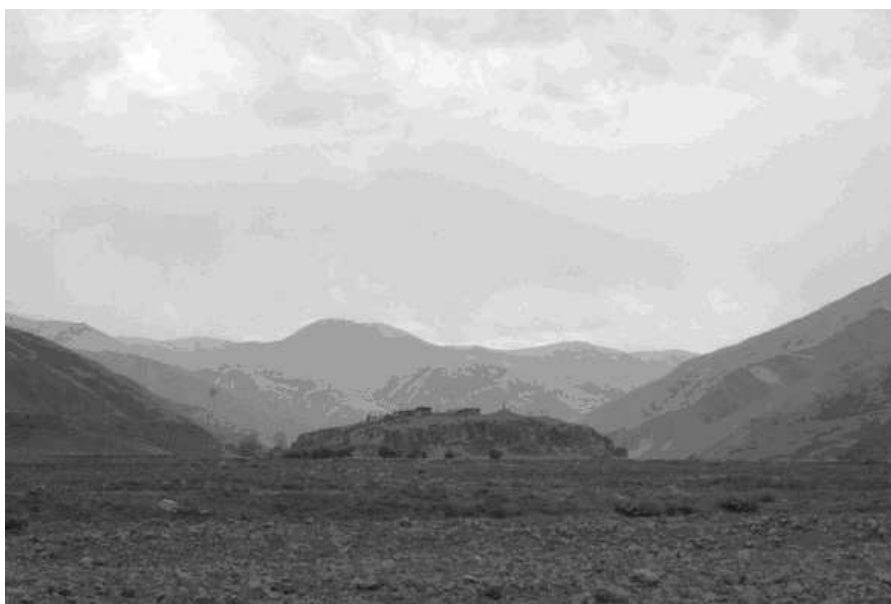
Image 2. Bang so dmar po, the tumulus of emperor Srong btsan sgam po in 'Phyong rgyas (May 2010)

The main tomb, at the center of the 'Phyong rgyas valley is Srong btsan sgam po's, the "Red Tomb" (Bang so dmar po), a squared form with sides of approximately 129 meters, and 13.4 meters high according to Gyurmé Dorje. Although it is probable that the tombs might have been profaned during the 11th century after the fall of the empire, and again later during the Dzungar invasion in the 18th century, no archeological excavation has been conducted to inform us about their actual contents.