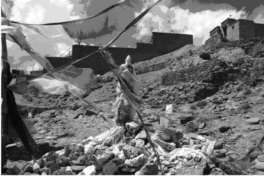
Image 6. Commemorative edifice of 'Jigs med gling pa's birthplace. In the background, dPal ri monastery

In his catalogue of teachings received ( thob yig ) 87 we see that he received the transmission of the seventeenth tantras through a lineage passing through Prajñāraśmi. 88 Similar connection is found for the gter ma transmission. 89 Having trained in the dPal ri monastery as an ordinary monk, he did two three-year retreats, the first in dPal ri monastery and then in bSam yas mChims phu. During his first retreat (1756-1759) in a hermitage of dPal ri called Śrī Parvata'i gling, 90 he focused on the creation and perfection of the Grol thig . 91 'Jigs med gling pa's retreat manual confirms his familiarity with the Grol thig 's