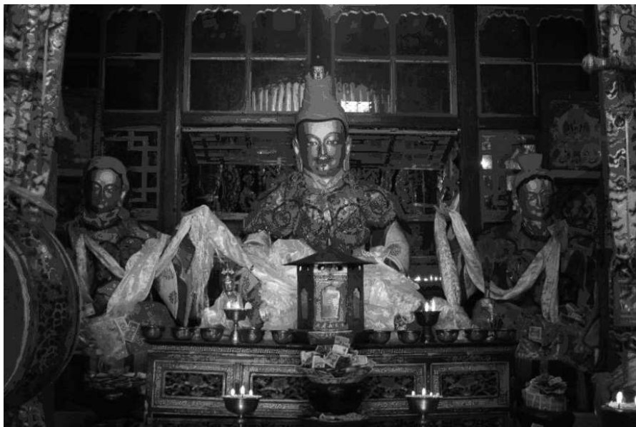
Image 4. Main statue of Srong btsan sgam po in the Srong btsan lha khang, with his two wives, Bhṛkuṭī from Nepal (on the left) and Wengcheng (on the right) (May 2010, the author)