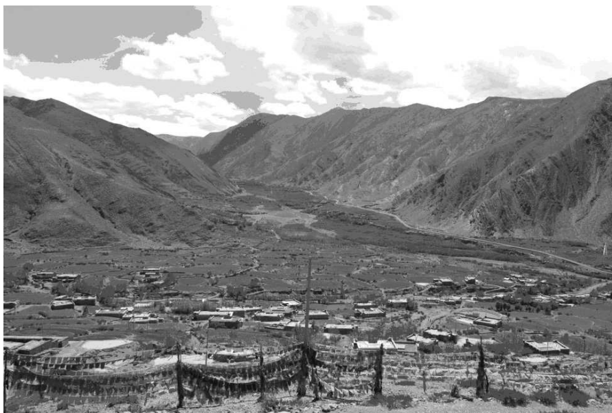
Image 5. The village of dPal ri grong tsho seen from the entrance of dPal ri monastery (May 2010, the author)

ljongs. Monks and nuns told me that they devote their time to the practice of this contemplative tradition. dPal ri monastery is also performing the rites for the local village dPal ri grong tsho (having around sixty houses; see Image 5), where 'Jigs med gling pa was born.