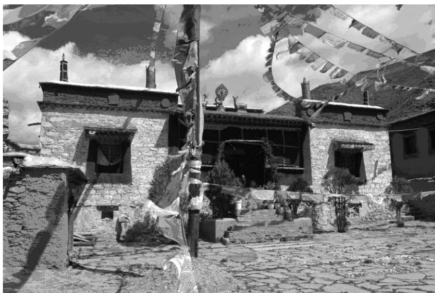
Image 3. The principal temple of dPal ri monastery (May 2010,)

dbang rDzogs chen 'Jigs bral byang chub rdo rje came from Khams for a pilgrimage in dBus. He visited dPal ri monastery and conferred empowerments and teachings and grew concerned about the monastery's poor state. Having made a special request to the government of Lhasa, he obtained the donation of a monastic principality and made important renovations. However, after the Fourteenth Dalai Lama fled to India, the Sixth Grub dbang rDzogs chen could not achieve his plans for dPal ri. During the Cultural Revolution (1966-1976), the monastery was totally destroyed. Already weakened, the specific tradition of dPal ri connected to the treasure lineage of Prajñāraśmi seems to have disappeared apart from its inclusion in Kong sprul's Rin chen gter mdzod . 65