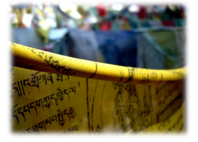
Figure 2 Prayer Flags offered as an offering

music are played are used by monks to contemplate the preceding section of text and to do visualizations and other practices as specified in individual pujas (Tibetan: mchod ).<sup>8</sup> Thus, these musical interludes are important as times for the actual practice of an individual ritual to occur. On another level, instrumental music is meant as a sound offering, as described above, which