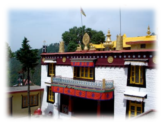
Figure 9 Tsechokling Monastery

According to one monk there, because of their small size they adopt a holistic approach training monks in a little of the disciplines as opposed to specializing in only one. Later on, if a particular monk is interested specifically in ritual or philosophy they have the choice to move to a larger institution where they can study their area of interest in greater detail.<sup>54</sup> A second practical example of the impact of size on ritual occurs in the instrumental