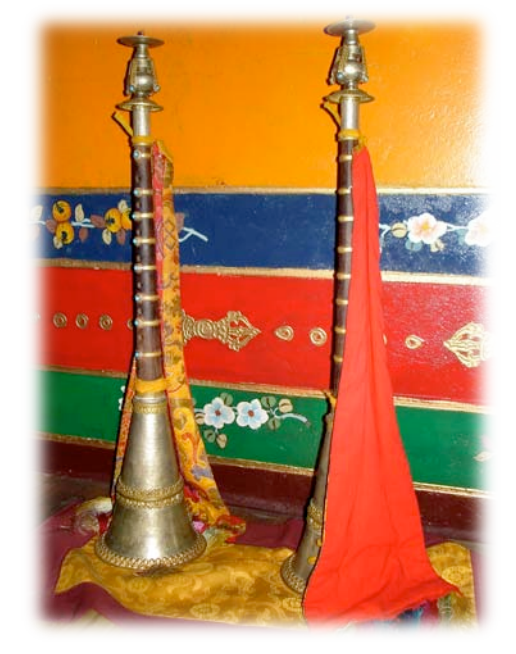
Figure 6 A Modern Oboe (L) and a Bombarde (R)

Figure 7 Rgya gling at Tsechokling Monastery