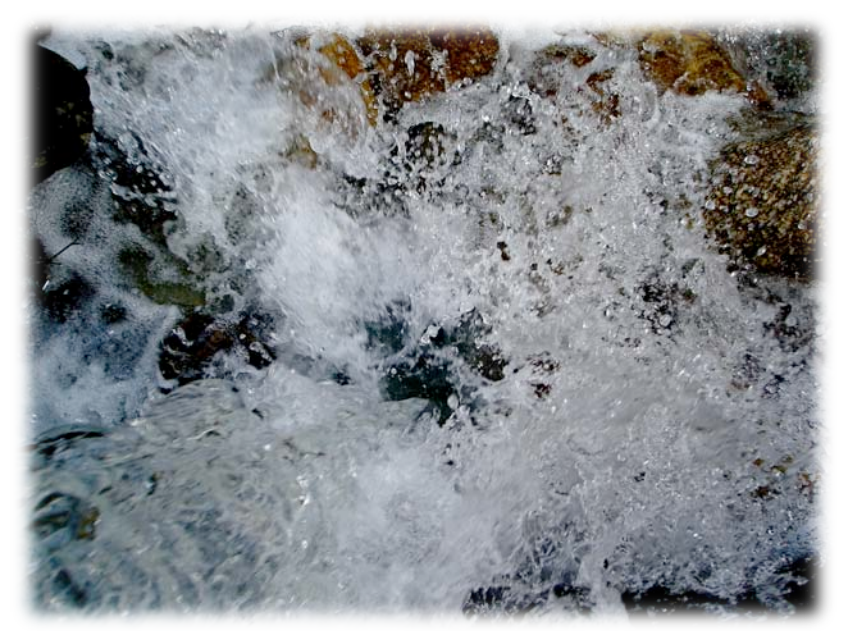
Figure 1: Waterfall in Dharamsala Valley

Instrumental Music and Creativity in Tibetan Buddhist Ritual