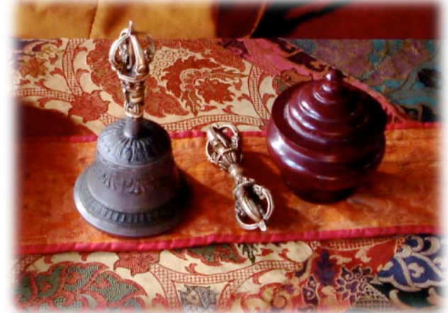
Figure 5 Dril bu and Rdo rje at Tsechokling Monastery

The dril bu and rdo rje are always used together as reminders of the inseparability of wisdom and method in Buddhist practice. Their use, even by one person, serves as a constant reminder to all assembled to keep their minds concentrated both in and outside of ritual on these ideas. Thus, despite being musical instruments they are also tools to help monks' meditations and