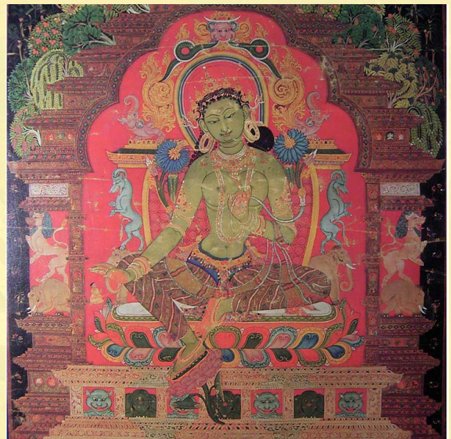
Arya Green Tara

This recent miracle of the Holy Image of Arya Green Tara at Bodh Gaya is indeed a rare occasion. "Nectar" represents the "true essences of the Buddhist teachings", which is a Holy Medicine to cure and liberate all kinds of sufferings. Hence, this recent miracle has important symbolic meanings to it: that the true meanings of the Buddhist teachings in its correct modern interpretations, which will eliminate all doubts and liberate all misled and deluded minds, will be propagated by the noble Arya Green Tara Herself.