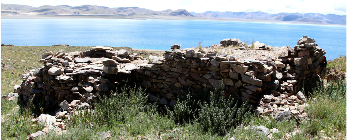
Fig. 1: The exterior of a smaller corbelled building that has retained much of its all-stone roof, located on the insular site of Do Drilbu (Do dril bu).

Despite the poor state of preservation of ancient Central Tibetan buildings, in the last 20 years, a surprisingly large range of pre-Buddhist residential monuments have been documented in Upper Tibet (comprised of the Stod and Changthang regions of the western and northern plateau: see Bellezza 1997; 2001; 2002; 2008; 2011; in press-a; in press-b, etc.). The main factor accounting for the relatively good physical condition of certain ruins in Upper Tibet appears to be the complete abandonment of many ancient sites long ago. Beginning perhaps even before Tibet's imperial period (ca. 650–850 CE), colder and drier conditions were ostensibly the primary mover in the dereliction of early residential sites. Nevertheless, paleoclimatological and geomorphological studies on a site by site basis are required to properly gauge the impacts of desiccation and contextualize them in an archaeological sense. Moreover, a complex mix of cultural, political and demographic factors also seems to be at play in the desertion of numerous