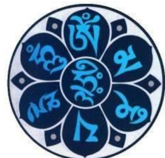
OM MANI PADME HUNG! HRĪH!

*HRĪH is the heart's seed syllable; it encapsulates the compassionate activity of the bodhisattva. In the HRĪH we dedicate the totality of our transformed personality (which has become the Vajrakaya) to the service of Amitabha . This is the realization of the Bodhisattva ideal, symbolized in the figure of Avalokishvara .