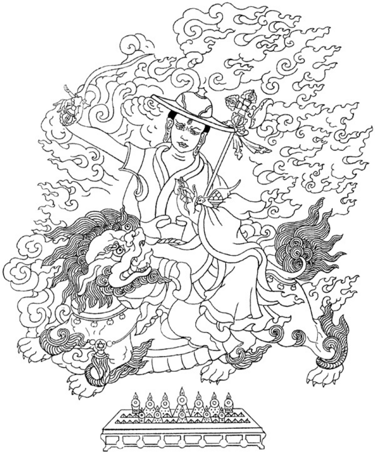
Wisdom Dharma Protector