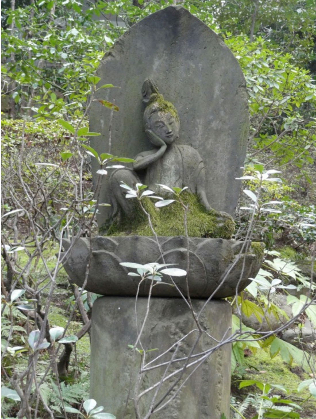
Figure 1. Nirvana? Picture taken in the garden of the Neza museum, Tokyo.