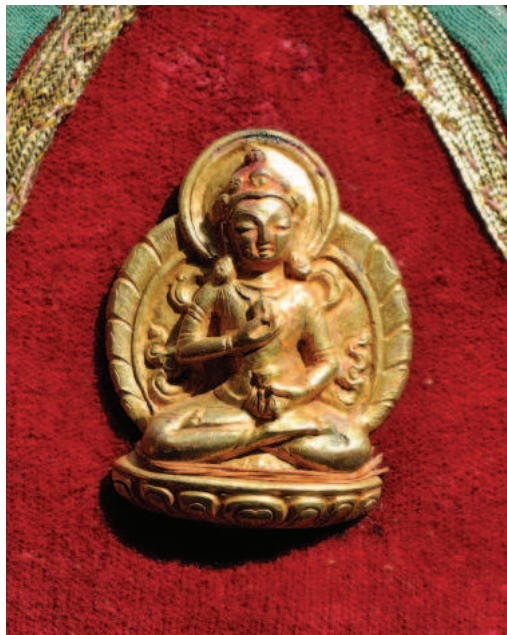
FIGURE 10. Detail of central Vajrasattva image in the Vajrācārya Sthavira Āju's ceremonial hat, Kwā Bahā, Patan, Nepal, 2012