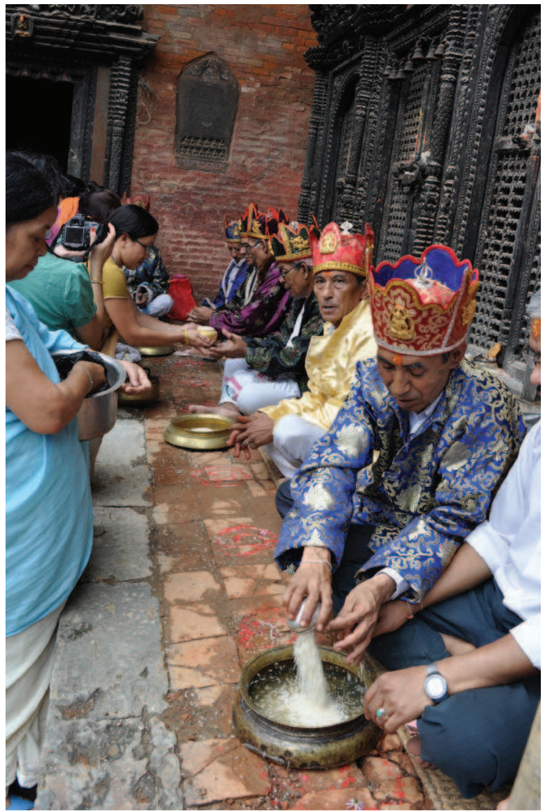
FIGURE 26. Daśa Sthavira Ājus from Ha Bahā receiving offerings from the community on Pañcadāna, Ha Bahā, Patan, Nepal, 2010

As practiced today, Pañcadāna allows the religious community to reenact the act of giving to Dīpaṅkara Buddha, and to the greater Buddhist saṅgha in the Kathmandu Valley, by making offerings to both Vajrācārya and Śākya members of the community. This day is one large saṅgha dāna , or community offering. During Pañcadāna, some monasteries provide an opportunity for the Daśa Sthavira Ājus to sit in the courtyards of their monastic compounds and receive alms from the lay community throughout the day. As illustrated in figure 26, the Ājus of Ha Bahā remain in the courtyard of their monastery to accept gifts, bestowing blessings on the faithful in return. The faithful first make offerings to the main shrine image of the monastery—in this case, Shakyamuni Buddha—and then proceed to make offerings to the Daśa Sthavira Ājus. The Ājus are seated next to their main shrine, lined up from eldest to youngest. The Buddha image and the Ājus are venerated in the same way, implying that the two garner the same respect