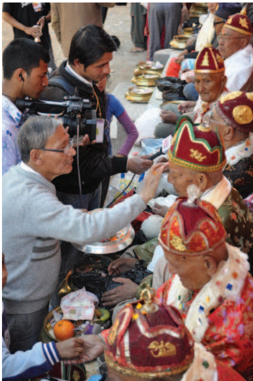
FIGURE 29. The Daśa Sthavira Ājus from Kwā Baha receive offerings during the Patan Samyak Mahādāna, Nāg Bahā, Patan, Nepal, 2012