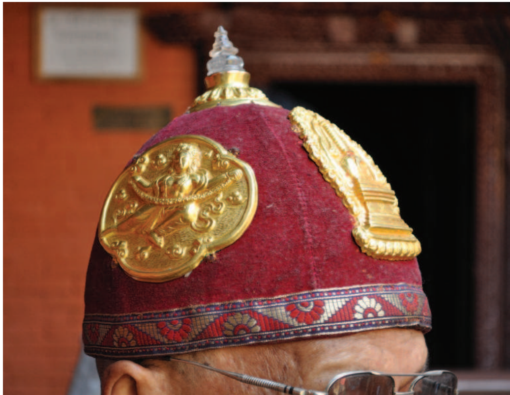
FIGURE 14. Detail of vidyādhara s (wisdom holders) flanking the central image on a Śākya Sthavira Āju's ceremonial hat, Kwā Bahā, Patan, Nepal, 2012

been used in the visual arts to indicate welcoming divine beings or heralding their arrival—the same associations are implied on the red hats of the Sthavira Ājus. There is a tremendous amount of variety in the depictions of the vidyādhara s, as the style of each crown and the specific forms of the flanking celestial deities are determined at the discretion of each Āju. 40 The choice of representation appears to be personal preference, as regalia is not passed down from Āju to Āju. Everyone maintains his own regalia, with new regalia being commissioned by the newly initiated Ājus. Thus, while the ritual regalia must follow a prescribed iconographic format, the material, style, and ornamentation can vary, as seen very clearly in the variety of vidyādhara configurations.