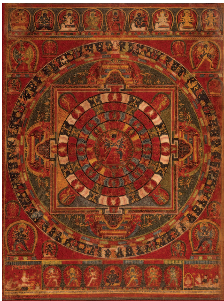
FIGURE 2. Mandala of the Buddhist Deity Chakrasamvara , Nepal, dated 1490. Mineral pigments on cotton cloth, 46 x 34 5/8 in. (116.84 x 87.94 cm)

repoussé crown. Beside each chakreśvara is an attendant assisting with the ritual. The crowns, raised seats, and surrounding ritual paraphernalia all demonstrate remarkable visual continuity from the fifteenth-century painting to the present day. The metal crown worn by the Āju in figure 4, however, is different from the red caps worn by the Daśa Sthavira Ājus for ceremonial events, which are discussed later in this paper and can be seen worn by Āju Dharma Ratna Śākya (fig. 5). As the Mandala of the Buddhist Deity Cakrasamvara illustrates, the different dress styles of these figures suggest various socio-religious roles within the Buddhist community.