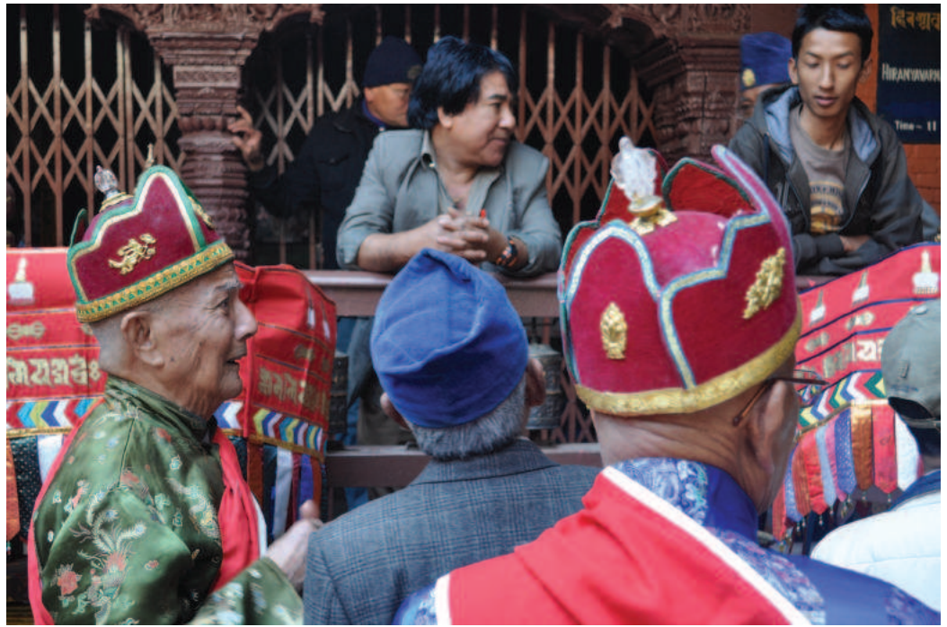
FIGURE 16. Overview of Sthavira Āju headdress with rock crystal half- vajras , Kwā Bahā, Patan, Nepal, 2012