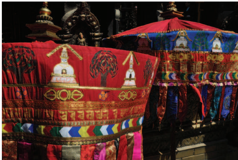
FIGURE 17. Umbrellas used by the Daśa Sthavira Ājus, Kwā Bahā, Patan, Nepal, 2012

In addition to the regalia that they wear, the Daśa Sthavira Ājus—like Buddhist and Hindu deities in Nepal—are distinguished during public celebrations and processions by the presence of attendants who carry ceremonial umbrellas above their heads. The use of the Newar term chatraṃkūju (“the honorable one who is sheltered by an umbrella”) reflects a category of respected beings whose status in the religious community is visually conveyed by these umbrellas (fig. 17), 44 which are clear signifiers of the high honorific status of important religious figures. The umbrellas that shelter the heads of the Ājus during processions have small votive stūpas on their pinnacles (fig. 18). These crowning stūpa forms are made of wood or of metal. For Newar Buddhists, the stūpa is a reference to the Svayambhū Mahācaitya, the ontological source of Buddhism in the Kathmandu Valley. As a self-arisen stūpa , Svayambhū was not constructed by human hands but emerged out of the earth and is afforded the status of Ādi Buddha (Primordial Buddha). The presence of this visual marker further demonstrates the high rank and status of those individuals or deities sheltered by umbrellas during public veneration. Thus, the