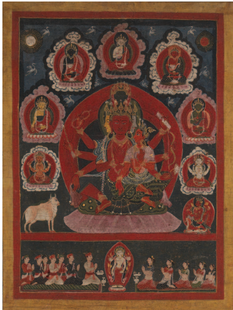
FIGURE 22. Bodhisattva Manjugosha with Consort , Central Tibet, Tashilumpo Monastery, 19th century. Opaque watercolor on cloth, 21 x 14 in. (53.34 x 34.56 cm)

The iconography of the ceremonial regalia of the Daśa Sthavira Ājus reflects the ideals promoted by the Newar Buddhist householder monk tradition. No longer does one need to take up the monastic robes as a wandering ascetic to achieve enlightenment. Instead, the Newar monastic system, governed by the Sthavira Ājus, is promoted as the path to spiritual attainment. Ājus reinforce the importance of the bodhisattva path to Newar Buddhism. They exemplify the monastic ideal, making the goal of enlightenment tangible for the greater community. Regarding their public persona within the Buddhist community, I contend that the ceremonial dress of the Sthavira Ājus promotes their status as living embodiments of enlightenment. This