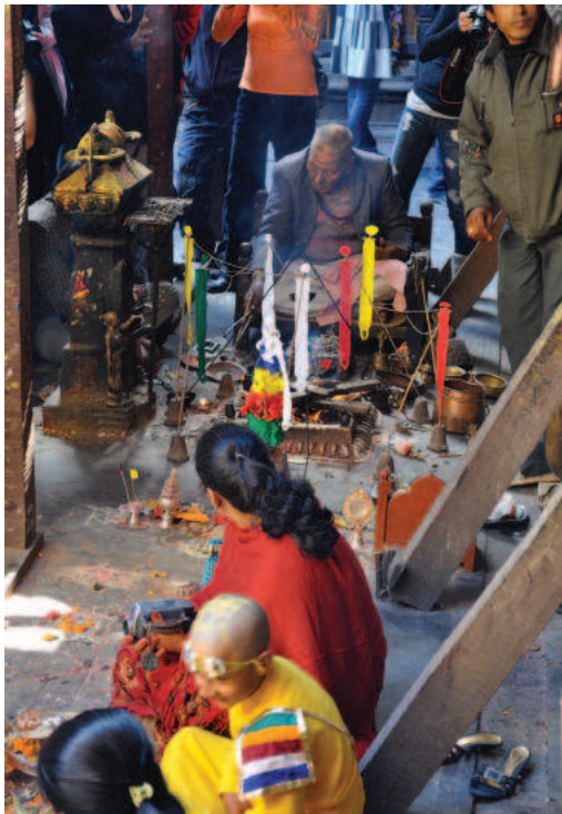
FIGURE 23. The senior Vajracārya priest ( cakreśvara ) performs rituals in the front of the main shrine at Kwā Bahā for the monastic initiation (known as the bare chuyegu ) of the novice monks of Kwā Bahā, Patan, Nepal, 2011