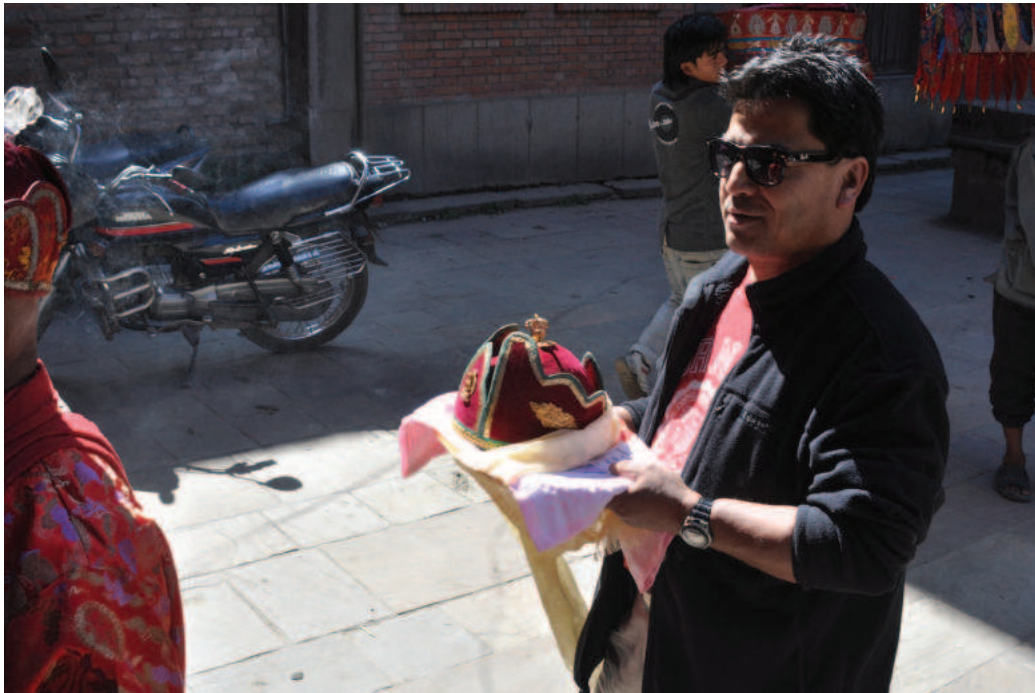
FIGURE 31. Ceremonial hat of an absent Sthavira Āju carried by a relative during the invitation procession for the 2012 Patan Samyak Mahādāna, Patan, Nepal, 2012

The red hats of the Daśa Sthavira Ājus are the clearest hallmark of the wearers' status as attained beings. One of the Ājus was unable to attend the 2012 Samyak due to illness. Despite his absence, his participation in the event was signified by the presence of his hat and umbrella. During the invitation procession for Samyak (fig. 31), the Āju's hat was carried by one of his family members, resting on a tray, sheltered by a parasol. During Samyak, the hat sat in the line with the other Ājus, receiving offerings throughout the day (fig. 32). In this way the Āju's hat manifested his presence, embodying the essence of the Āju and his buddhahood. In Nepal, headdresses are among the most primary elements that demonstrate the status of Ājus as buddhas. The hat itself is symbolic of buddhahood, so much so that even when the wearer is absent his presence is embodied by this attribute. The hat is the one attribute that both symbolizes the Āju's socio-religious status and signifies his presence.