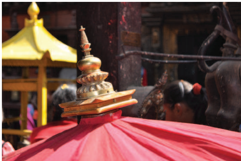
FIGURE 18. Detail of the votive stūpa on top of an umbrella of a Daśa Sthavira Āju, Kwā Bahā, Patan, Nepal, 2012