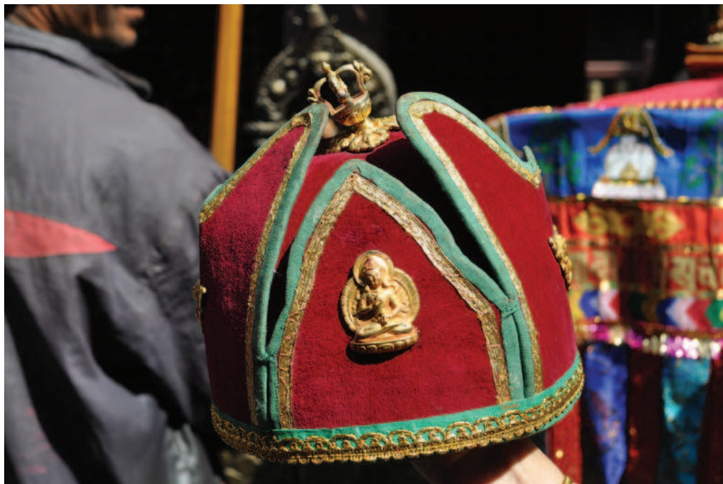
FIGURE 7. Ceremonial hat of a Sthavira Āju, Kwā Bahā, Patan, Nepal, 2012