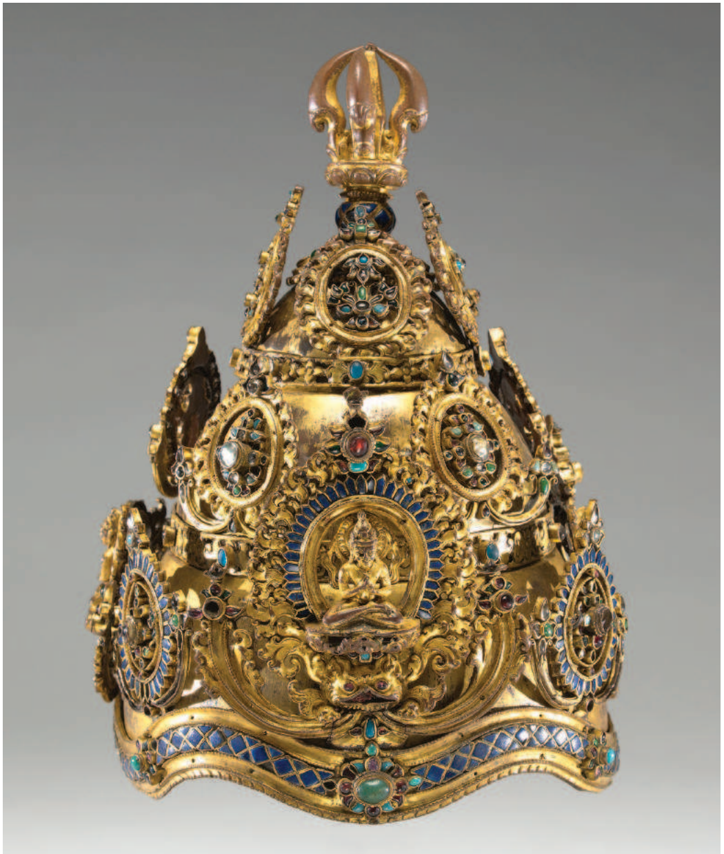
FIGURE 3. Ritual crown, Nepal, 12th–13th century. Gilded copper alloy and gemstones, 11 ½ x 7 ¾ x 8 ¾ in. (29.21 x 19.69 x 22.23 cm)

they are intricately connected to all aspects of religious life. Their duty is to serve the entire community, not only the monastery, and their title confers tremendous respect in addition to religious and moral authority. 30 Furthermore, the Ājus embody the monastic heritage of the larger Buddhist saṅgha . As such, the system of the Daśa Sthavira Ājus establishes continuity with ancient Buddhist practices, while their appearance publically reinforces the intrinsic Buddhist values of the community.