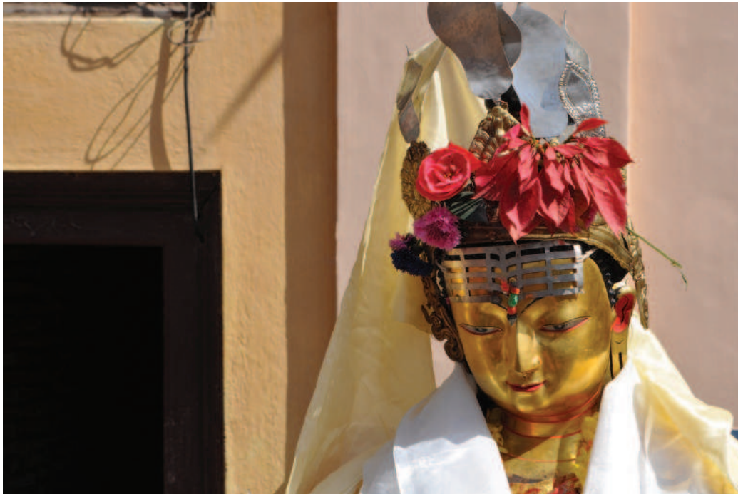
FIGURE 34. Forehead diadem worn by a Dīpaṅkara Buddha image during the 2012 Patan Samyak Mahādāna, Nāg Bahā, Patan, Nepal, 2012