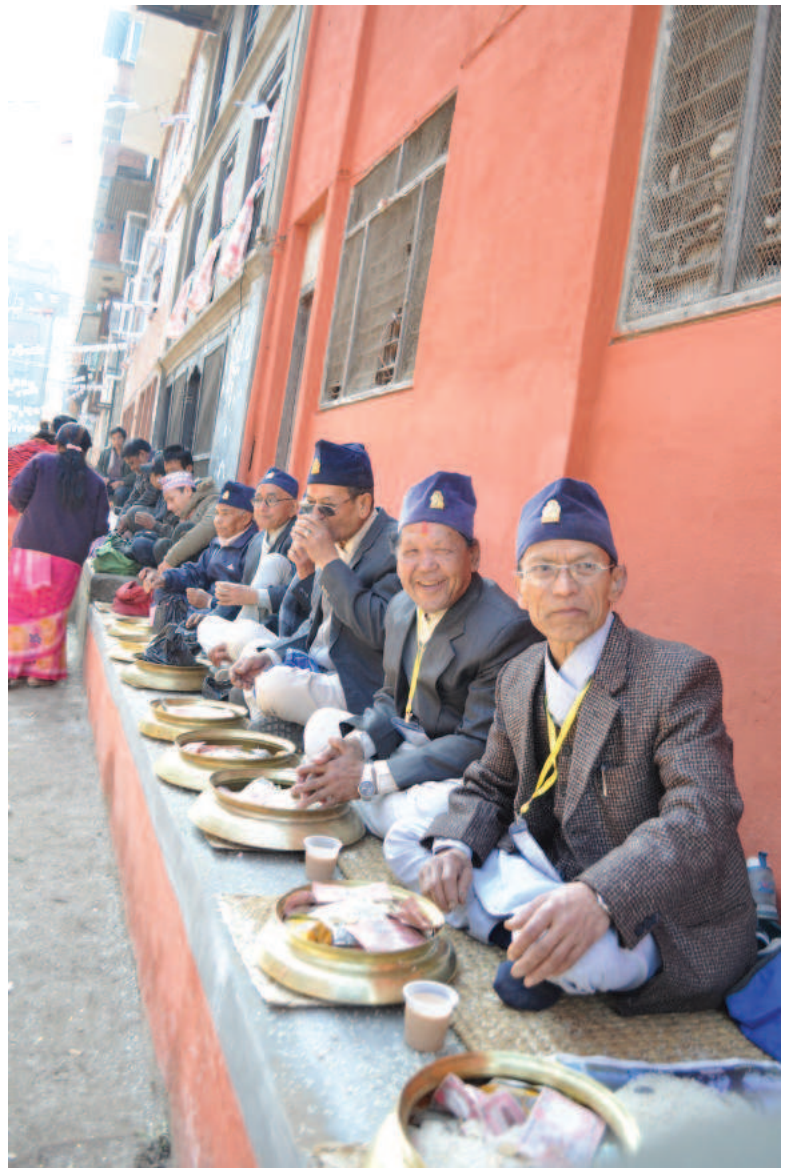
FIGURE 6. Members of the group of twenty Digī Sthavira Ājus receiving dāna during the Patan Samyak Mahādāna, Nāg Bahā, Patan, Nepal, 2012

While there are slight variations from monastery to monastery in the ritual dress of the Ājus, a standard set of ceremonial regalia distinguishes these elders from other members of the saṅgha . As seen in figures 1 and 5, the uniform of the Daśa Sthavira Ājus consists of a silk brocade jacket paired with a white cotton gown, an elaborately ornamented soft-sided cap, and a red sash that is worn across the left shoulder and tied at the right hip. The red hats discussed