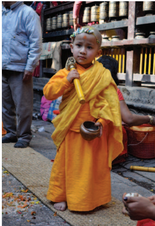
FIGURE 24. Initiation of novice monks at Kwā Bahā, Patan, Nepal, 2011