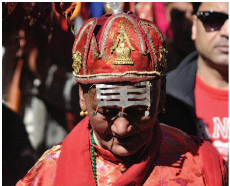
FIGURE 11. Detail of central caitya in the Śākya Sthavira Āju's ceremonial hat, Kwā Bahā, Patan, Nepal, 2012

These differences reflect the elevated status of Vajrācārya caste members, relating back to their role, discussed earlier, as Masters of the Diamond Way and to their function as priests and ritual specialists.