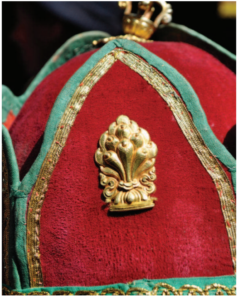
FIGURE 15. Detail of the flaming jewel on the back side of a Sthavira Āju's ceremonial hat, Kwā Bahā, Patan, Nepal, 2010