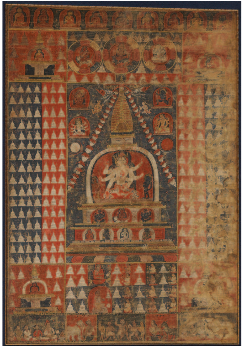
FIGURE 21. Myriad Stupas with Ushnishavijaya , Nepal, dated 1412. Opaque watercolor on cloth, 33 ¼ x 23 in. (84.46 x 58.42 cm)

this dress type in Nepalese paintings is outside the scope of this paper, it is important to note that the earliest appearance of the ritual dress of the Ājus is in paintings from the early Malla Dynasty. By the fifteenth century we find visual evidence of figures wearing the same garments, as noted in my discussion of the Mandala of the Buddhist Deity Chakrasamvara (see fig. 2). Another early example can be seen in the painting Myriad Stupas with Ushnishavijaya (fig. 21), dated to 1412. In the lower left corner, we see a red-capped figure who wears a white garment facilitating the Lakshacaitya ceremony, an offering of one hundred thousand stupās . The inclusion of ritual scenes in Newar paintings continued in subsequent centuries, with ritual regalia frequently illustrated in these narratives. By the later Malla Dynasty and into the eighteenth and nineteenth centuries, an abundance of visual material illustrated the ceremonial regalia of the Ājus. In a nineteenth-century example from the Tashilumpo Monastery in Central Tibet, titled Bodhisattva Manjugosha with Consort (fig. 22), the ritual scene along the bottom register is more prominent in the overall composition than it is in works from earlier periods. Though painted in Tibet, the work demonstrates a clear understanding of Newar stylistic conventions from the period.