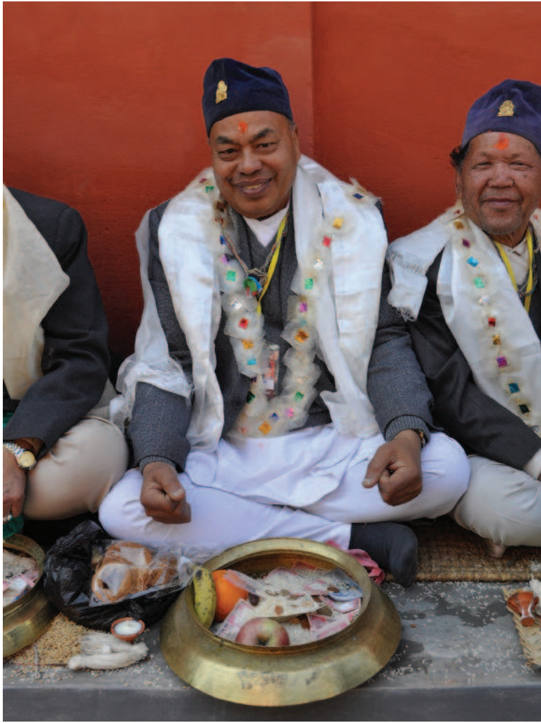
FIGURE 20. Digī Ājus receiving offerings during the Patan Samyak Mahādāna, Nāg Bahā, Patan, Nepal, 2012

priest transforms himself into Vajrasattva for the performance of the ritual; again, the presence of Vajrasattva in the center of the priest's headdress reinforces the socio-religious identity of the Vajrācārya Daśa Sthavira Ājus as the community's ritual specialists. Likewise, the Śākya Daśa Sthavira Ājus' identity as Śākyavaṃsa ("of the Buddha's lineage") is articulated through the presence of a caitya on the front side of their hats. While some of these caityas are adorned only with garlands streaming down from the tops of the stūpas , others feature depictions of a buddha seated within the caitya , as seen in figure 11. In these cases, the seated buddha is Śākyamuni Buddha, displayed with his outstretched right hand touching the ground in bhūmiśparśa mudrā and with his left hand holding an offering bowl. Despite the differences between the central images on the Vajrācārya and Śākya hats, the primary signifiers of the red cap promote their wearers' identity as wisdom-holders of the Newar Buddhist tradition. Together, the red hat, silk brocade jacket, white skirt, read sash, and umbrellas promote a persona of the Daśa Sthavira Ājus that visually reaffirms their identity as the living embodiments of the daśa pāramitās , or the ten perfections.