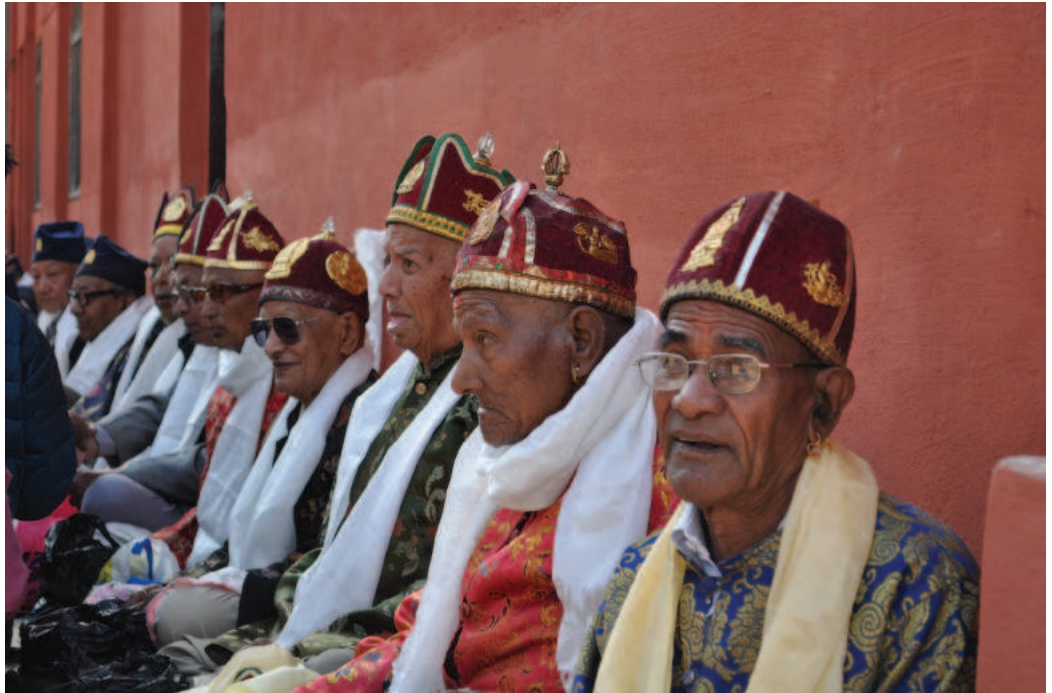
FIGURE 28. The Daśa Sthavira Ājus from Kwā Baha, Nāg Bahā, Patan, Nepal, 2012