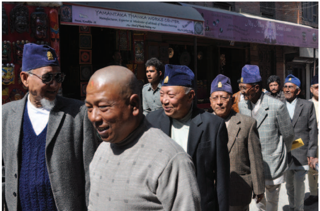
FIGURE 19. Digī Ājus from Kwā Bahā walking in procession during the invitation ceremony for the 2012 Patan Samyak Mahādāna. Patan, Nepal, 2011

Visually, the iconographic components of the red hats of the Daśa Sthavira Ājus communicate their elevated socio-religious status in the community. The placement of Vajrasattva on the hats of the Vajrācārya Ājus reflects their role as ritual specialists for the community. As part of their life-cycle rites, the Vajrācārya receive initiation (Skt. dīkṣā ) as vajra masters (Nw. ācāḥ luyegu ), which establishes each individual's symbolic connection to Vajrasattva. For Newar Buddhists, Vajrasattva is the primordial teacher of the tantric path, but he also represents the purified tantric practitioner. Thus, the headdress denoting the Vajrācārya as vajra masters visually articulates their identity as embodiments of Vajrasattva. Moreover, during certain rites, the Vajrācārya