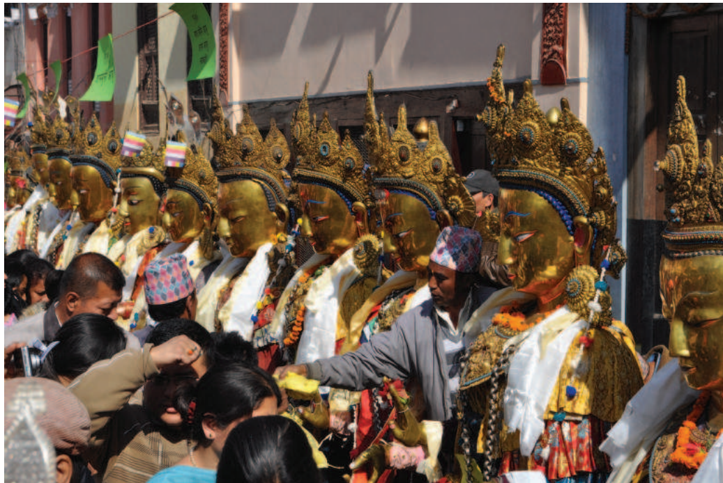
FIGURE 27. Rows of Dīpaṅkara Buddha images lined up to receive offerings during the quadrennial Patan Samyak Mahādāna celebration, Nāg Bahā, Patan, Nepal, 2012

The performative elements of veneration take place on the afternoon of Samyak. These rituals focus on the Ājus and associated high-ranking members of the saṅgha from Kwā Bahā. One of the most significant acts is the ritual washing (fig. 30) of the Ājus' feet (Nw. likhya cāykegu ). During this ritual, the Thaku Juju (Thakuri king) of Patan, a descendant of the