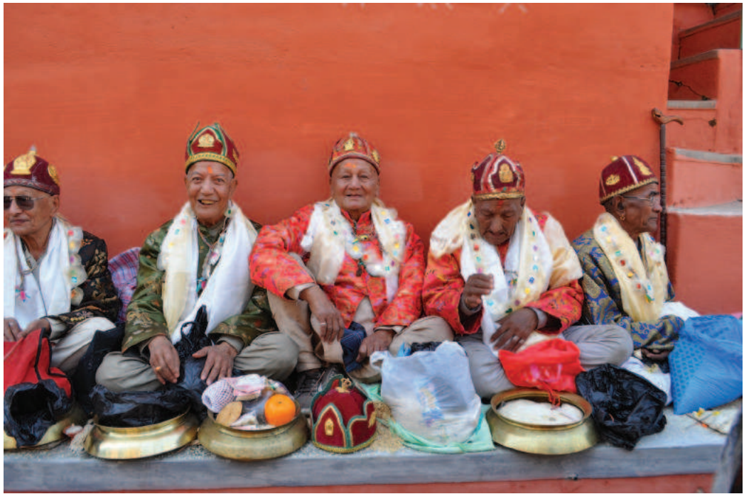
FIGURE 32. The Sthavira Ājus of Kwā Bahā with the hat of an absent Āju in line to receive offerings in his place, Nāg Bahā, Patan, Nepal, 2012

If we consider all of the individual components of the ritual regalia worn by the Daśa Sthavira Ājus at Kwa Bahā, there are clear iconographic connections between the Ājus and buddhas. The most striking of these parallels can be identified through an analysis of the Ājus' assembled forms and their ritual dress. When dressed in their ritual uniforms, Ājus visually demonstrate the same status as a buddha. They have elaborate headdresses, wear silk garments, and are shaded by umbrellas when they walk (fig. 33). The Ājus are living embodiments of enlightenment and exemplify the path necessary to achieve this goal. As with the Dīpaṅkara images, the dress of the Daśa Sthavira Ājus articulates their status in well-defined visual terms.