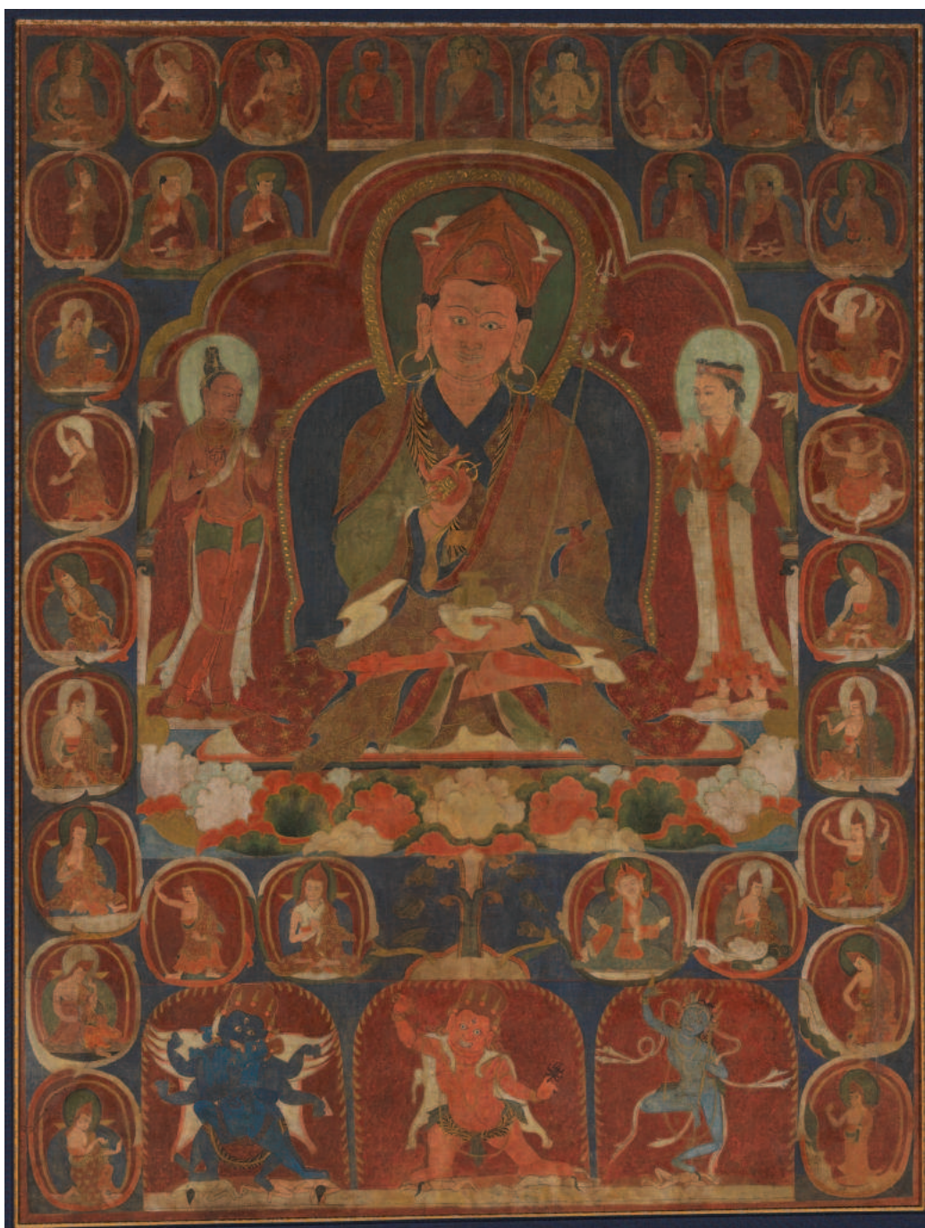
FIGURE 8. Padmasambhava , Central Tibet, 14th century. Opaque watercolor on cloth, 41 x 31 3/8 in (104.14 x 79.69 cm)

Among the Daśa Sthavira Ājus at Kwā Bahā, caste distinctions between Vajrācārya and Śākya elders require them to feature different identifying features on the fronts of their hats, as illustrated in figure 9. For the Ājus who are of the Vajrācārya caste, a figure of Vajrasattva is displayed (fig. 10). Vajrasattva represents the purified practitioner and is acknowledged as Ādi Buddha. For Śākyas, a Buddhist caitya —often with a figure of the Buddha seated within the reliquary monument—serves as the hat’s central image (fig. 11).