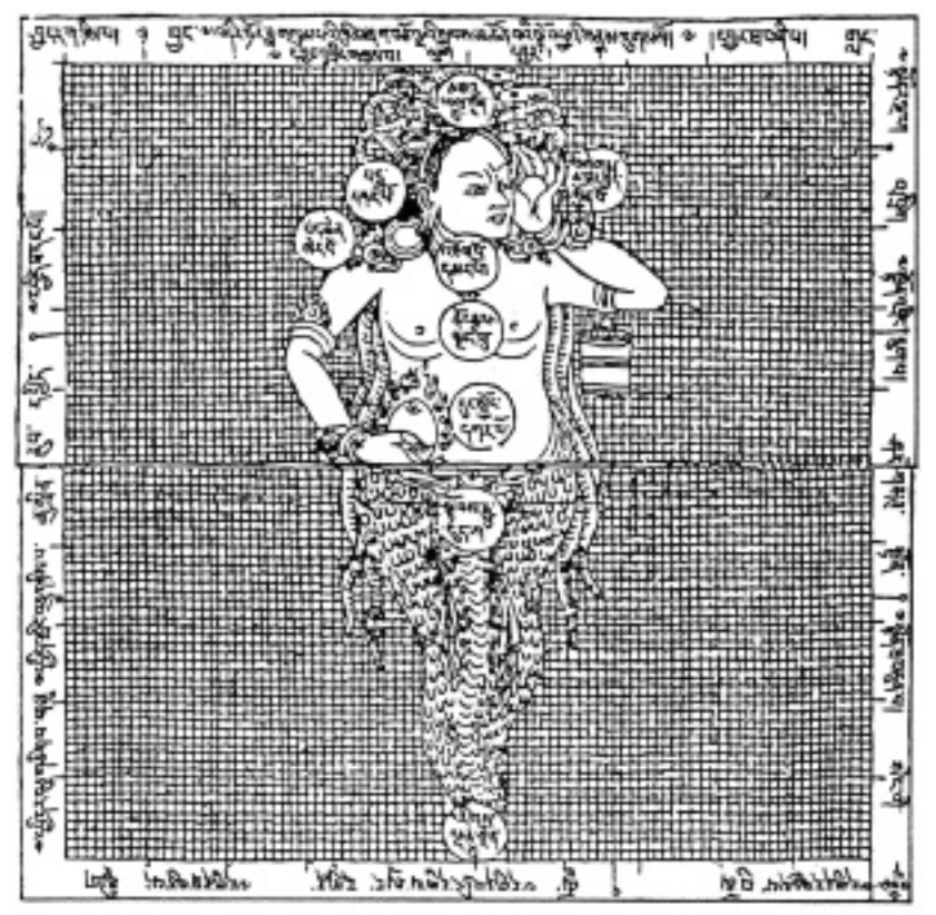
Figure 6: Uraga: serpent-bellied earth-lord (extracted from the Sumpa Khenpo)

Clearing the site is carried out by digging up the site [commencing at the armpit] of the uraga [naga] after having determined [its position].<sup>14</sup> Once