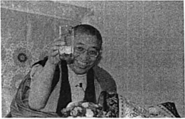
The Very Venerable Thrangu Rinpoche