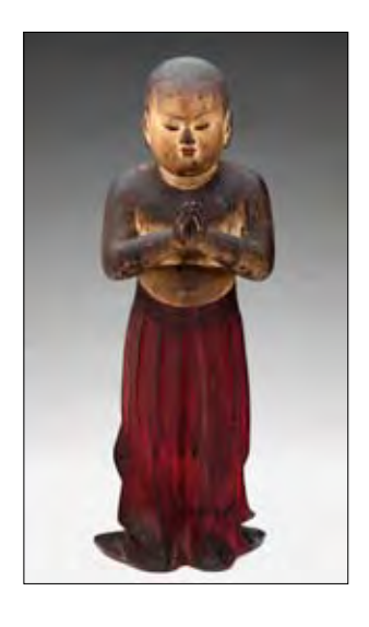
FIGURE 1. Prince Shōtoku at age two, c. 1292. Japanese cypress wood with polychromy and rock-crystal-inlaid eyes. Arthur M. Sackler Museum, Harvard University Art Museum (formerly Walter C. Sedgwick Collection).