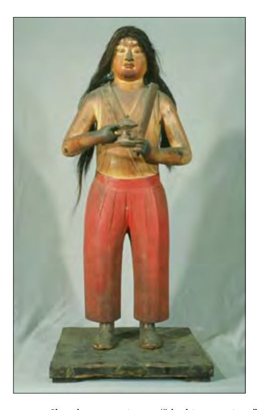
FIGURE 2. Shōtoku at age sixteen ("the hirsute prince," Shokuhatsu Taishi 植髪太子), late thirteenth to fourteenth century, Japanese cypress wood with polychromy and rock-crystal-inlaid eyes, Kakurinji, Hyōgo Prefecture.

Again and again in Japanese legends, the mediation (actual or only implied) of some great man is shown to be essential for establishing contact with the Buddha.<sup>27</sup> Things associated with one leads a person closer to the other. As a symbolic bridge for the Japanese people, Shōtoku had the distinct advantage of having both historical and spatial reality. The monks of Shitennöji or Höryūji needed only to look out their back door to see places inextricably bound to the life of the prince, and they could read an account of Shōtoku's life or view his images to find evidence of his equivalency with Śakyamuni. Through the con-