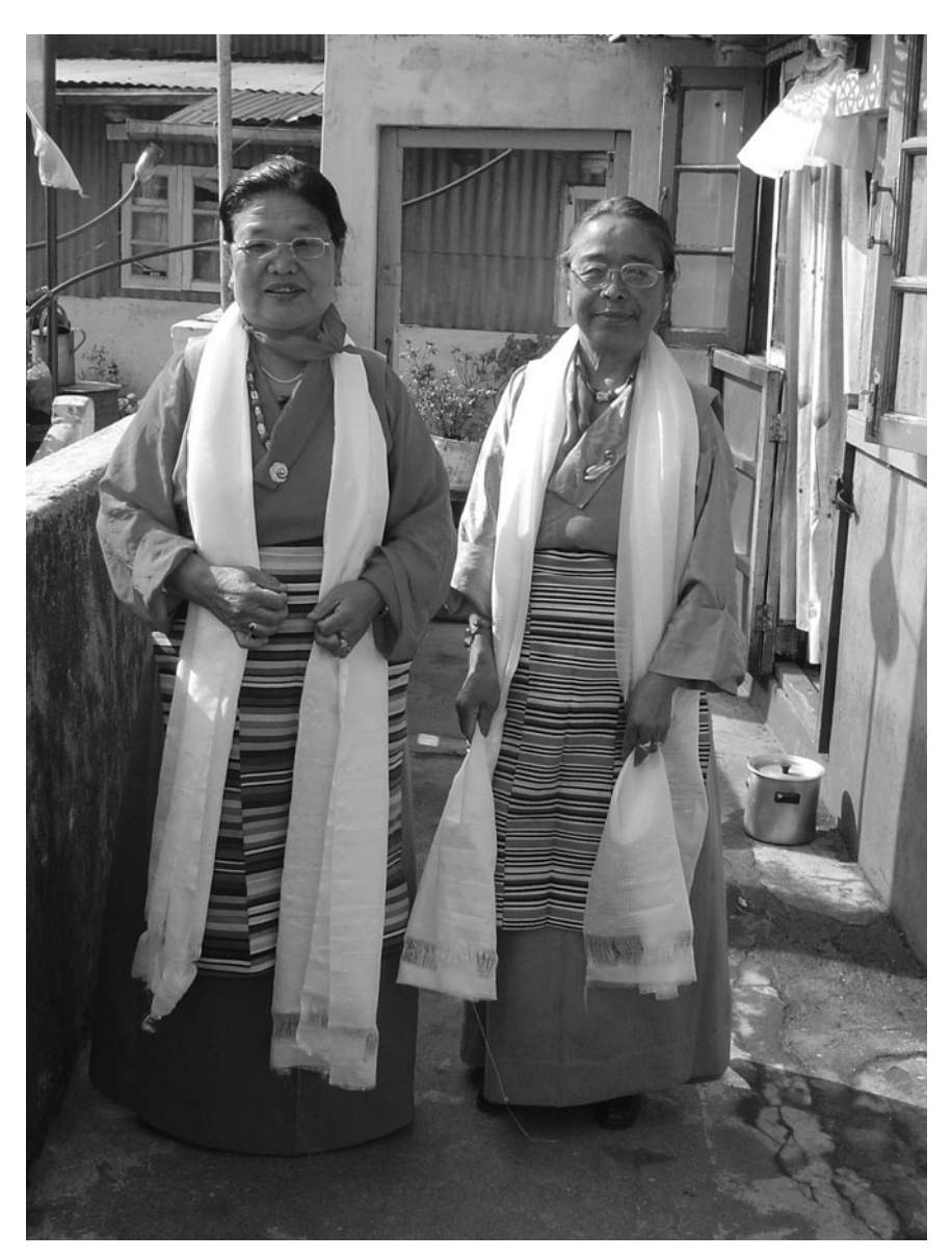
Figure 2.3 The two momo.las wearing katags and standing outside of the home they kindly shared with me. The photograph was taken after they received a wang from a visiting lama

qualities of divine beings are transmitted via the lama, who is conceived as inseparable from the deities themselves. By initially receiving the blessings of an intermediary lama and then continuing in the prescribed practice, the devotee