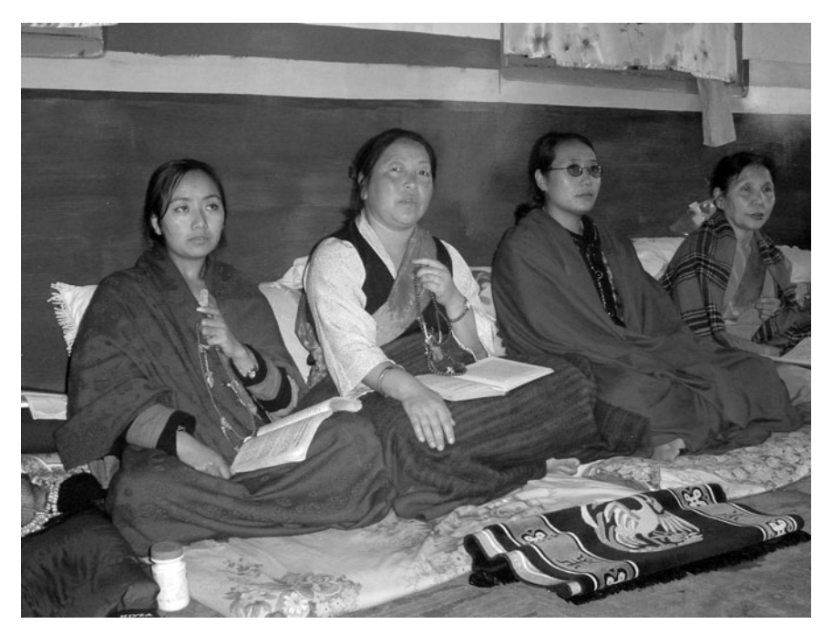
Figure 4.1 Women reciting mantras at the end of the day

during nyungne , non-verbal communication was compulsory: alternate days of silence were mandatory in the practice and they also enabled other types of communication vital to the ethnographic project. Indeed, socialization persisted amid vows of silence (cf. Vargas 2006: 73). Nyungne participants interrelated in ways other than the spoken word. Participants engaged with one another through body language, using their arms, heads and even mouths to express or mime what they needed to convey. By means of common local hand gestures where the little finger points through a clenched fist, they would indicate when they were going to the toilet, questioning each other as to whether or not they needed to go to the bathroom before wandering off together sometimes holding hands. With a nod of the head in a certain direction and a contorting pout of the lips to follow the motion, participants could sway their neighbours' attention toward their own interests, be it an occurrence inside the temple or a scene witnessed through the window as they gazed outside.