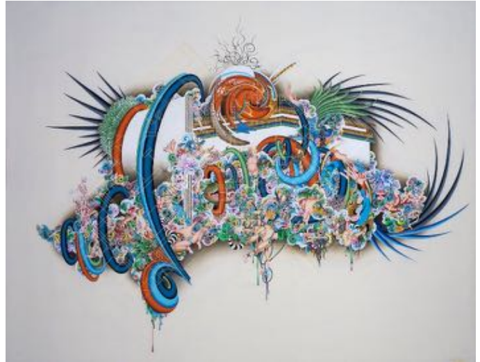
UFO (Unidentified Fettering Organization) No. 3