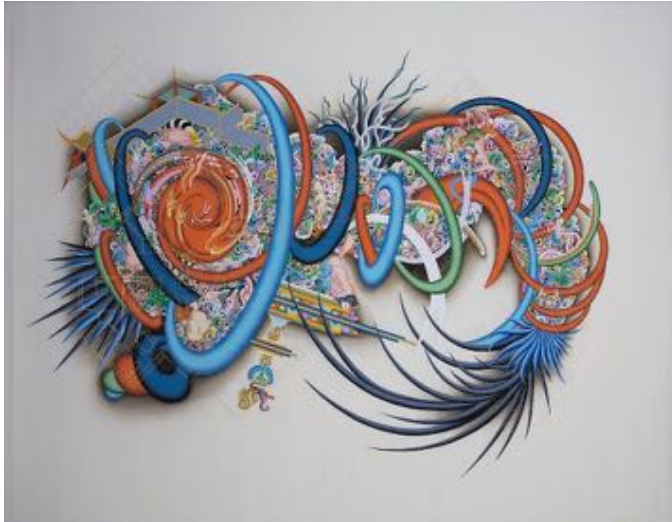
UFO (Unidentified Fettering Organization) No. 2

Acrylic, ink, and gold pen on cotton