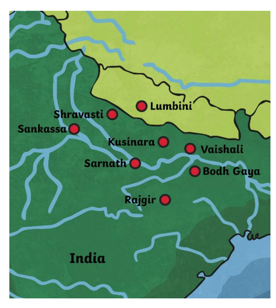
A map showing the 'Eight Great Places'