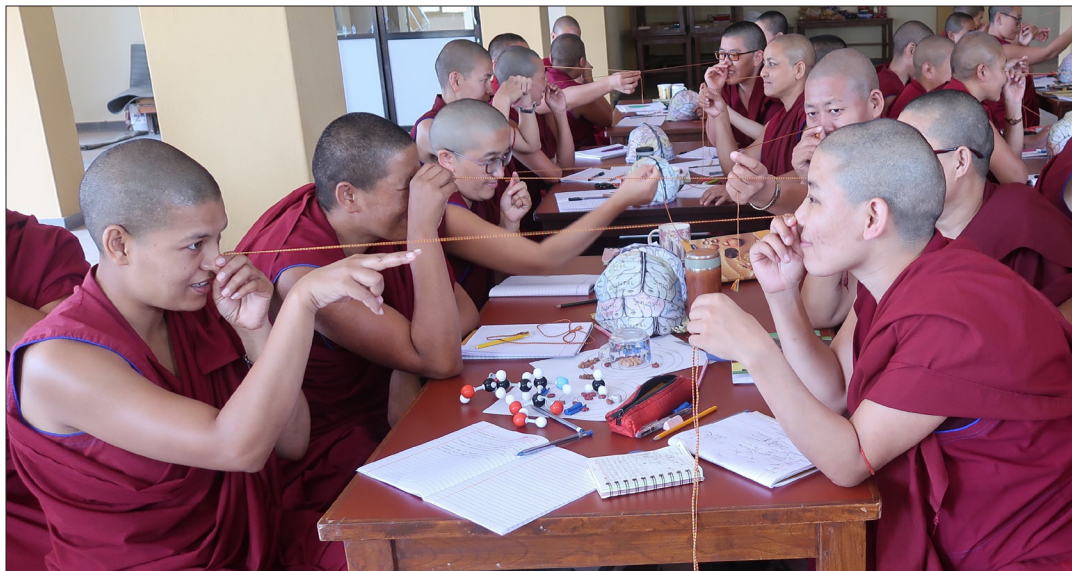
Figure 3: Workshop on sensory neurobiology at the Kopan Nunnery in Nepal (2018).

DP: In our modern scientific tradition, we try to understand the world as detached observers—the essence of our science is objectivity. We build telescopes and microscopes and all sorts of probes to investigate things outside of our mental space. In Buddhism and a number of Asian philosophical traditions, they have a different worldview. The Dalai Lama and others have described aspects of Buddhist tradition as being a kind of internal science. They use contemplative practices to focus inward and deeply investigate the nature of mind. It's not that one's wrong and one's right—they're both right—but they achieve different things. It's easy to see that all of modern technology came out of Western science—the Tibetan Buddhists didn't invent iPhones. But the Western scientific tradition didn't lead to deeply introspective and analytic meditation practices.