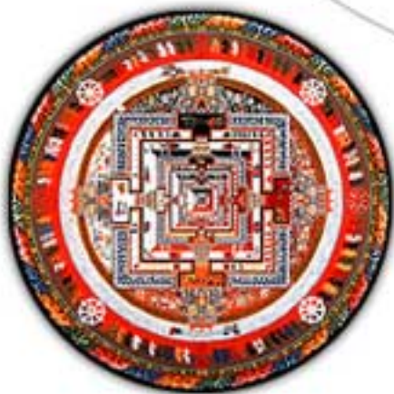
Chart of the Elements in a Kalachakra Sand Mandala