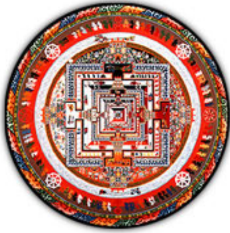
Chart of the Elements in a Kalachakra Sand Mandala