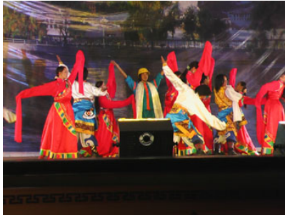
Figure 2b: County-level dance troupe perform in Nag chu, 2004.

ballet moves. The dances are performed in complex formations rather than the traditional circle, and tend to be multi-sectional compositions.