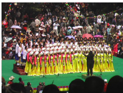
Figure 1: Tibetan choir sings in a festival in Dar rtse mdo, May 2005.