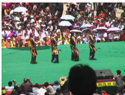
Figure 9b: Girl band perform in festival in Dar tshe mdo, May 2005.

There are also solo artists who dance in a more western pop/soul/rap style as a part of singing performance, such as Chung zhol sgröl ma, who launched a female soul style of singing in Tibet. These global dance (and vocal) styles also undermine