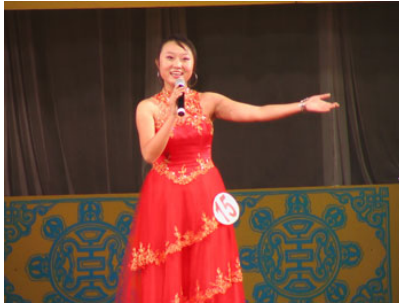
Figure 5a: Bel canto style in Gannan competition, August 2005.

Most singers also follow the norm of walking to the back of the stage with their back facing the audience during instrumental interludes and then turning to the audience again when they sing again. A new trend in Tibetan-style dance songs is to dance a few very basic steps strictly during the interludes in Tibetan songs based on or made for dancing, still leaving the “taboo” on dancing and singing together unbroken. However, static performances of even dance songs with dance-based lyrics are found. Globalized patterns that have entered Tibet seem set to change this performance style, but in 2005, this blueprint still remained very much the default and the norm.