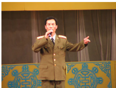
Figure 5c: Chinese nationalist song in Gannan competition.

time, with Thang go la's immensely popular "disco" medleys filmed in Thang go la with backing dancing from the Thang go la dancers, and a variety of other productions using dance troupe performers, again achieving polished and modern performance.