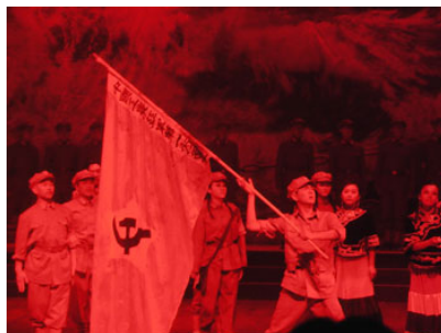
Figure 4b: Crossing of Luding bridge drama by Dkar mdzes dance troupe, May 2005.

However, whilst the state is vigorously appropriating “popular” culture, “the people” can be seen to be actively appropriating the state style. I will examine two examples of this, one urban and one rural. Nang ma bars, which started around 1997, were originally drinking houses in Lha sa where traditional music from Lha sa known as nang ma was performed along with other