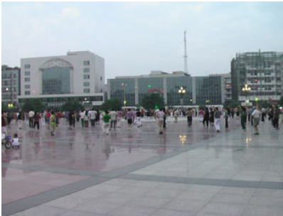
Figure 7a: Sgor bro in Shuanlu county square, Chengdu, August 2005.

We have been looking at adaptations of circle dance by troupes in formal performances. Circle dance as it was before the 1950s is much more participative, performed by amateur members of the community for themselves; the whole sense of a chosen troupe competing, let alone performing on stage, however “traditional” or unmodernized their style, is a modern change, again echoing the dance troupe norm of professionalizing performance. However, a public, participative, non-audience-oriented but modern form of circle dance also exists and is a standard of nang ma bars, dating at least from 2000, when the VCD of “ a ba sgor bro ” 58 – still the most widely known and danced circle dance ( sgor bro ) of nang ma bars – was released. 59 It is also danced in town squares in Dkar mdzes prefecture (Kham), Chengdu (Shuanlu County, initiated by the Kham pa Tibetan population), Xining, and probably other areas too, first beginning, it seems, in Chengdu around 1998.