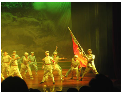
Figure 4a: Crossing of Luding bridge drama by Dkar mdzes dance troupe, May 2005.

Taiwan style and with Tibetan lyrics as well as Chinese (although Chinese lyrics tend to dominate), traditional songs or songs closer to traditional styles (such as nomad songs [ 'brog glu ] and rdung len ), and the new more global-style girl bands and boy bands. Explicitly Chinese nationalist and political material has been greatly reduced in the performances of state troupes, but it has not disappeared (see figures 4a and 4b, which are photos of a lengthy dramatic performance by the Dkar mdzes Prefecture dance troupe of the crossing of the Luding bridge on the Long March on the seventieth anniversary of this occasion).