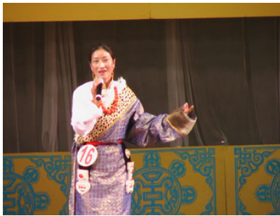
Figure 5b: Nomad song in Gannan competition, August 2005.

Most singers also follow the norm of walking to the back of the stage with their back facing the audience during instrumental interludes and then turning to the audience again when they sing again. A new trend in Tibetan-style dance songs is to dance a few very basic steps strictly during the interludes in Tibetan songs based on or made for dancing, still leaving the “taboo” on dancing and singing together unbroken. However, static performances of even dance songs with dance-based lyrics are found. Globalized patterns that have entered Tibet seem set to change this performance style, but in 2005, this blueprint still remained very much the default and the norm.