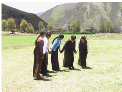
Figure 2a: Traditional style group dance from a village near Dar rtse mdo.