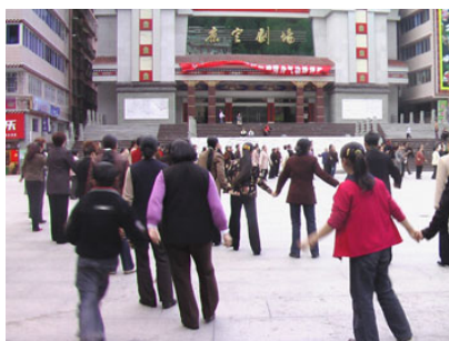
Figure 7b: Sgor bro in Dar rise mdo square, Dkar mdzes Prefecture, May 2005.

The separation of singing and dancing in public circle dance can be seen most obviously as emerging as part of the package of dancing to pop songs à la dance troupes out of the hegemonic appeal of modernity and the will not to look backward in the urban contexts of town squares and nang ma bars. In the nang ma bars in particular, as stated above, the dance troupe model is now the unquestioned norm of dance performance, and anything else would be surprising. Even with the public circle dance in nang ma bars, at least some of the paid performers lead, ensuring a critical mass of dancers who know the steps and thus fusing the public circle dance to the staged circle dance performances. 60