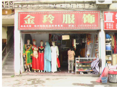
Figure 3c: Shop in Chengdu selling floaty, exotic costumes for dance troupes and nang ma bars.

In the embodiment of the explicitly named "new society," the blanket reformation of the old, the accompanying banning or heavy repression in Tibet of "traditional" performing arts unless carrying propaganda lyrics from the 1950s until 1980, and the propagation of this style alone through the state-controlled media (radio, loudspeakers, film, and limited television), the state style solely constituted musical and dance modernity in Tibet and China. This meant therefore