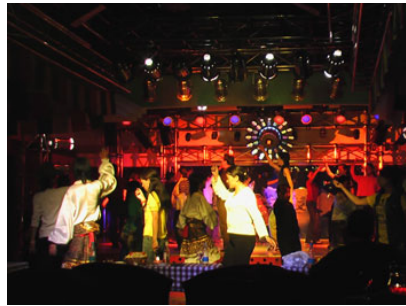
Figure 7d: Sgor bro in nang ma bar in Gannan prefecture town, June 2005.

This delinking, reconfiguration and hybridization of people, place, identity, style and language is a feature of modernity and globalization in general. However, it is even more sharply a fact of Tibetan modernity due to the rapid influx to Tibetan areas of Chinese immigrants who neither know nor subsequently learn Tibetan, arriving to make money from the economic boom which has, along with the poor level of education in Tibet, resulted in a greater demand for skilled labor than local supply can fill. 63 Speaking Chinese is now an economic and practical necessity in Tibetan cities, while speaking Tibetan is not. Furthermore, the vast majority of Chinese migrants to Tibetan areas do not pick up the local language due to still prevalent cultural attitudes toward minorities as inferior/backward and so forth, compounded by zero pressure from the government for Chinese migrants in Tibetan areas to learn the indigenous language. 64 Therefore, Chinese participants in circle dance (and there are many, especially in town squares) cannot sing along.