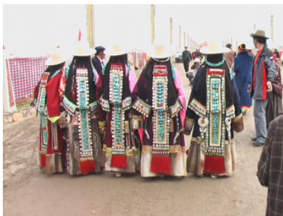
Figure 3b: Traditional ornaments of Nag chu nomads.

These modifications represented certain unprecedented changes to the world of Tibetan music and dance as a whole. First, whilst change in the form of the mixing and migration of styles (largely Tibetan inter-regional) certainly existed in pre-1950s Tibet (though it is not possible to say how extensively), 24 the state style was the first style that simultaneously and uniformly changed theoretically all regional styles at once, in accordance with aesthetics very much outside of the interlocking world of Tibetan regional styles. 25