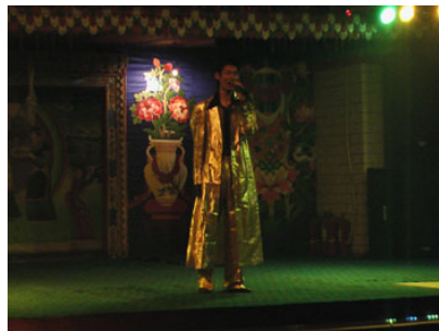
Figure 8b: Gold PVC suit, compere in nang ma bar, Nag chu, August 2004.