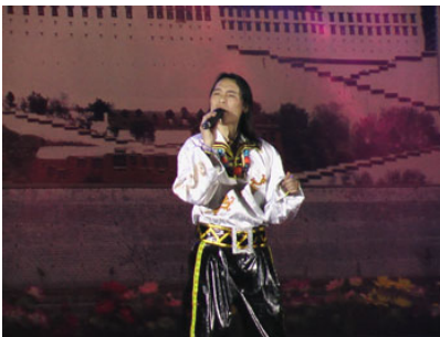
Figure 8a: PVC trousers and Tibetan shirt in nang ma bar, Lhasa.

We have seen a widespread acceptance of many aspects of the state style due to the new cultural inclusiveness of the state, and also upward mobility and social aspiration in the realm of the public. This process has involved a struggle for hegemony between people and state. Since the turn of the twenty-first century, however, a steady flow of global musical and dance modernities has reached Tibet via the global media and migration of people, and a hegemonic struggle of a new order has therefore begun with forces above the state (in geo-political and economic terms) and also more lateral to it (such as India and Nepal). The state, ever aware of the social and political implications of style and identity in music, continues to accept/appropriate globalized forms into dance troupe performance and TV variety shows. However, there are some interesting reconfigurations of song and dance emerging that do suggest change of a new order again, and new possibilities for the ways modernity is conceived.