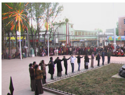
Figure 7c: Sgor bro in Lithang county square, Dkar mdzes Prefecture, May 2005.

However, there is further reason for the lack of simultaneous singing and dancing in public circle dance that relates to a key aspect of modernity other than the musical stylistic and aesthetic modernity set by the state. As Appadurai describes, the correlation of place, ethnicity, language, and culture is being weakened in global modernity. With increased movement of people across and within national and other borders, heterogeneous communities are increasingly common, as are