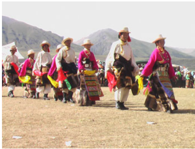
Figure 6: Entry of dancers in Damshung horse race 2004, dance competition.

“raw material” of “folk” music/dance. This involved higher hands and faster, more virtuosic performances, with women jumping as well as the men, and accelerating foot stamping which drew cheers from the crowd. There was also a move to complexity and variety in performance, with sections of dance juxtaposed with nomad songs (not traditionally a part of circle dance) performed by several groups. In one case there was a narrative drama setting for the dance, and in another, a solo cameo performance. However, none of the performers had been trained in conservatoires, and there was no attempt to modify voices to bel canto or Chinese style, which is difficult anyway to do without training. Similarly, despite high hand moves, the really characteristic stretched ballet posture of the state style was also absent, and there were no balletic moves but rather the heavy foot stamping characteristic of nomad dance. 45 The troupes wore matching clothes, but in the sense of their best local clothes rather than special costumes, and brightly colored floaty costumes were absent, apart from a little girl who danced solo in a very kitsch outfit. 46