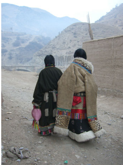
Figure 3a: Heavy winter Tibetan clothes in rural A mdo.