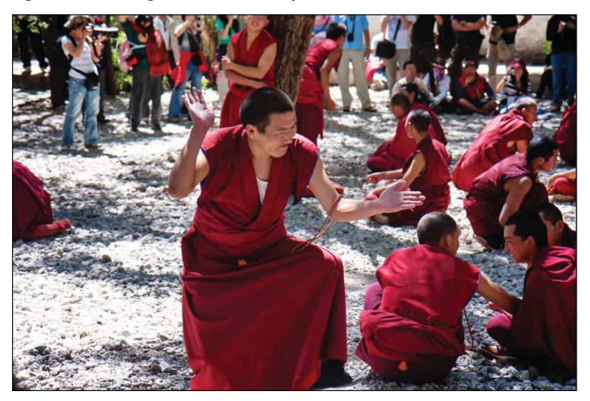
Figure 2: Debating at Sera Monastery in Lhasa