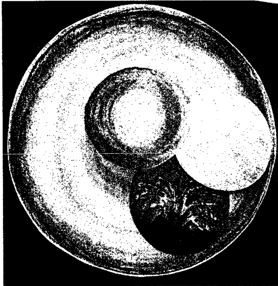
Mandala from Fincher's creatingmandalas.com

With respect to colour choice, Fincher states ones choice of colours expresses ones innermost thoughts, feelings and intuitions. In the analysis of colour choice, the self-helper can decode the messages being sent by his or her unconscious (1991, 33). The location of colour within the mandala is also important according to Fincher. "Colors placed in the top half of your mandala most often relate to conscious processes. Those in the bottom half tend to show what is going on in your unconscious" (1991, 35).