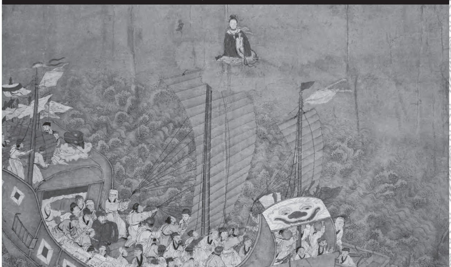
Painting of the sea goddess Mazu and the Song Embassy on a boat in high seas. Mazu is dressed in red, holds a hu tablet, and hovers on a cloud above one of the ship's masts. A high official on the boat is also dressed in red and is shown kneeling in prayer. Ink on paper, c. 1700–1800.

he multiplicities of Chinese religion can be hard to grasp for North American students. For some, "Chinese religion" might bring to mind bustling temples with people offering incense to a dimly lit statue. When I teach Chinese religions, on the first day of class, I often ask students what they know about Chinese religions. There are always a few students who offer that there are three religions (Confucianism, Daoism, and Buddhism) in China, and sometimes a few will also offer that the People's Republic of China officially recognizes five religions (Buddhism, Daoism, Islam, Catholicism, and Protestant Christianity).