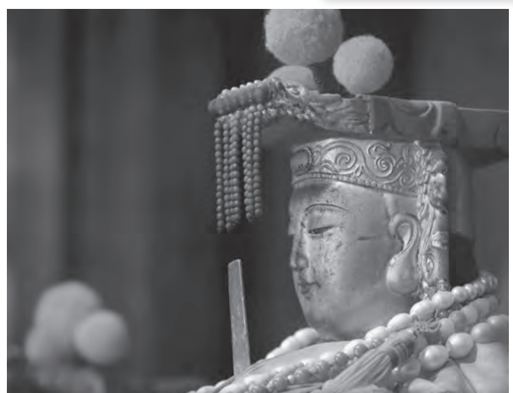
The Mazu in the Daoist temple in Magong City, Penghu, Taiwan. The temple is believed to be over 400 years old—the oldest Mazu temple in Taiwan.

A. Palmer put it, "Rather than a marker of ethnic or national divisions, then, Mazu appeared as a node linking and scrambling different polities and identities."14 Mazu's ancestral temple is located in Meizhou in the eastern part of Guangdong Province in the People's Republic of China. The Mazu Temple in Beigang, Taiwan, received ash from the incense burners of the Meizhou temple in the Qing dynasty, which is one way the sacred efficacy of a temple is transmitted to a new site. Therefore, the Beigang temple is connected to Mazu's home and so can serve as the "mother" temple for other Mazu temples in Taiwan. Although the incense at the Meizhou temple was extinguished during the Cultural Revolution (making the Beigang temple in some sense older), it remains a key site for pilgrimages. In fact, pilgrims from the Dajia Mazu temple visited Meizhou in 1987 and acquired an image there that allowed them to claim a direct link to the mother temple. The Meizhou Mazu visited