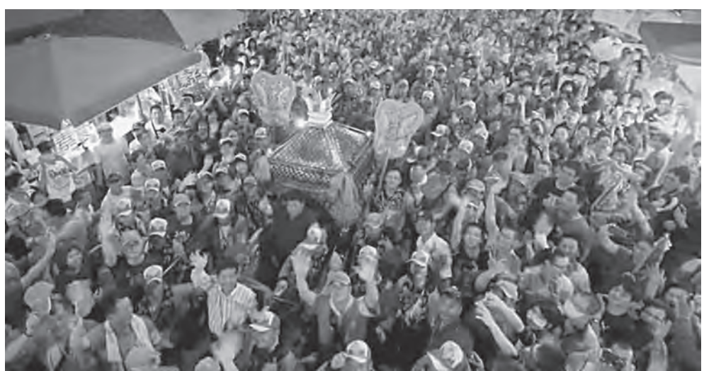
Pilgrims surround Mazu's sedan during the Dajia Mazu Pilgrimage from the Mazu Temple in the Dajia District of Taichung, Taiwan, to the Xingang Fengtian Temple and back. Mazu's sedan is carried night and day during the 271-mile, nine-day pilgrimage.