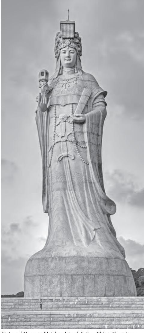
Statue of Mazu on Meizhou Island, Fujian, China. There is an identical Mazu statue in Mazu Village, Taiwan. They contain 365 granite stones and are 47.5 feet tall.

The story of how Lin Moniang became Mazu is a clear example of apotheosis: when human beings exhibit divine powers, both before and after death, they can be elevated to divine status. This is a conception of deities and deification that is central to Chinese religion, and in contrast to how gods are understood in many other religious traditions.