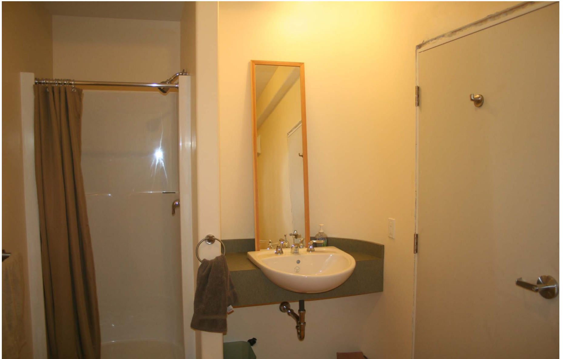
Main floor Washroom. Allows some support for disabled persons.