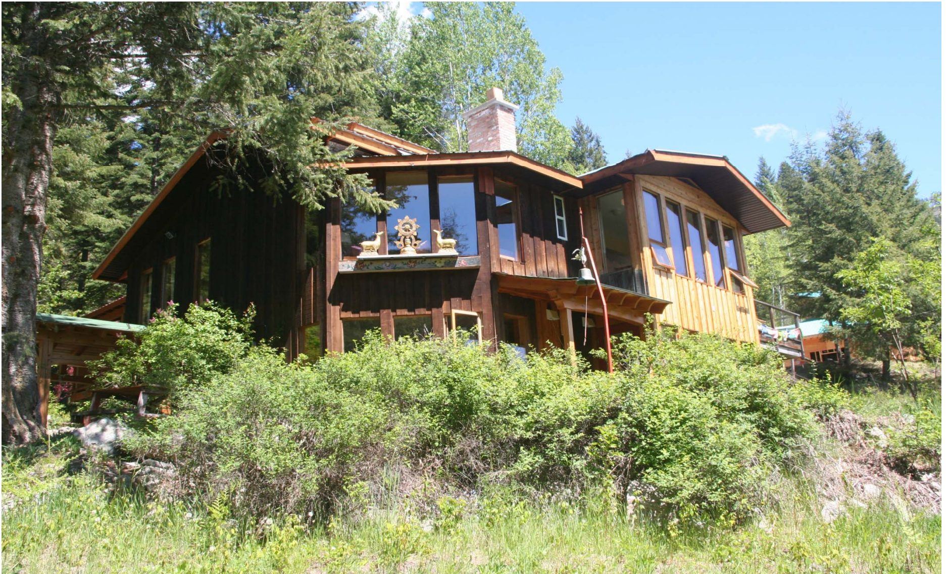
View from road of the front of the Gompa.