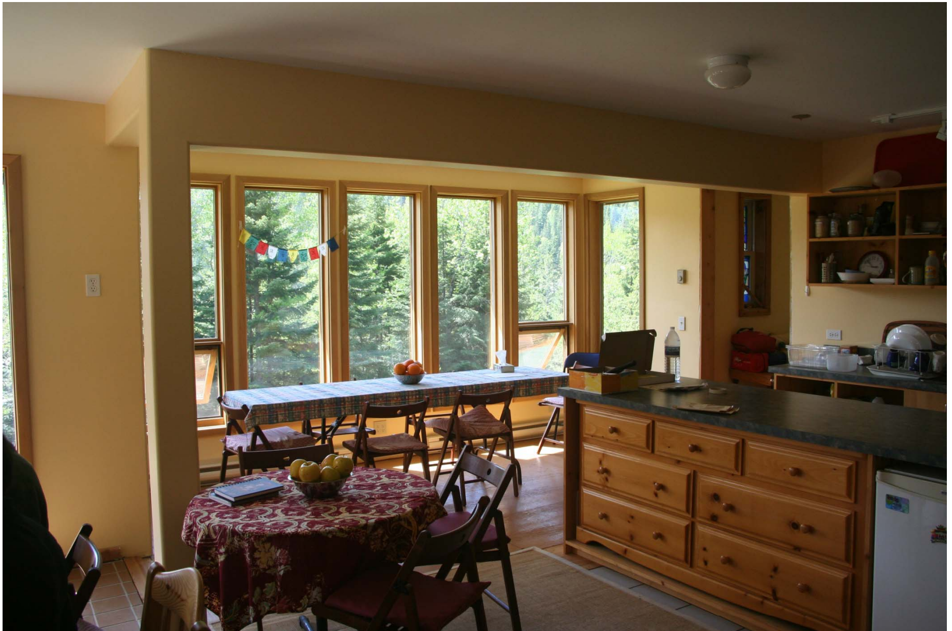
Eating area renovations were completed two years ago.