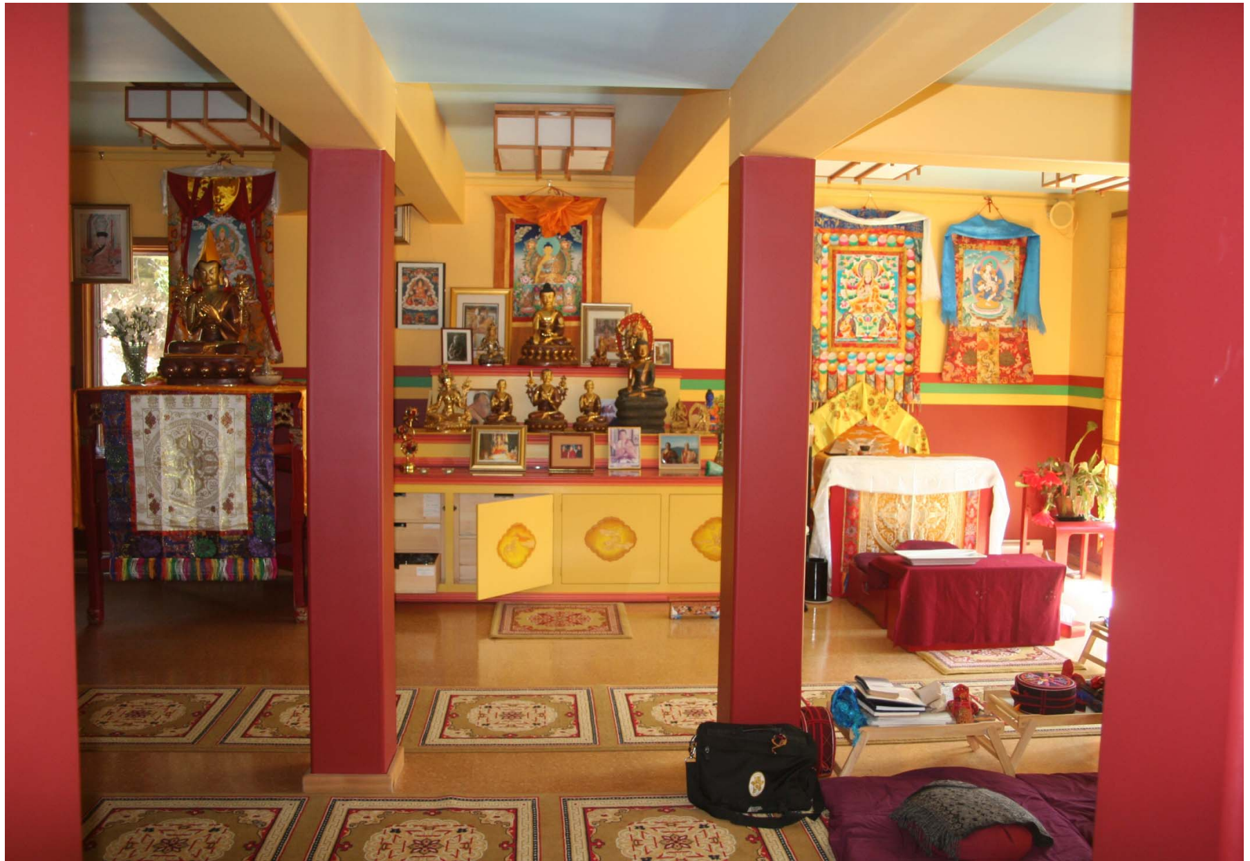
View of Gompa Shrine room from entrance.