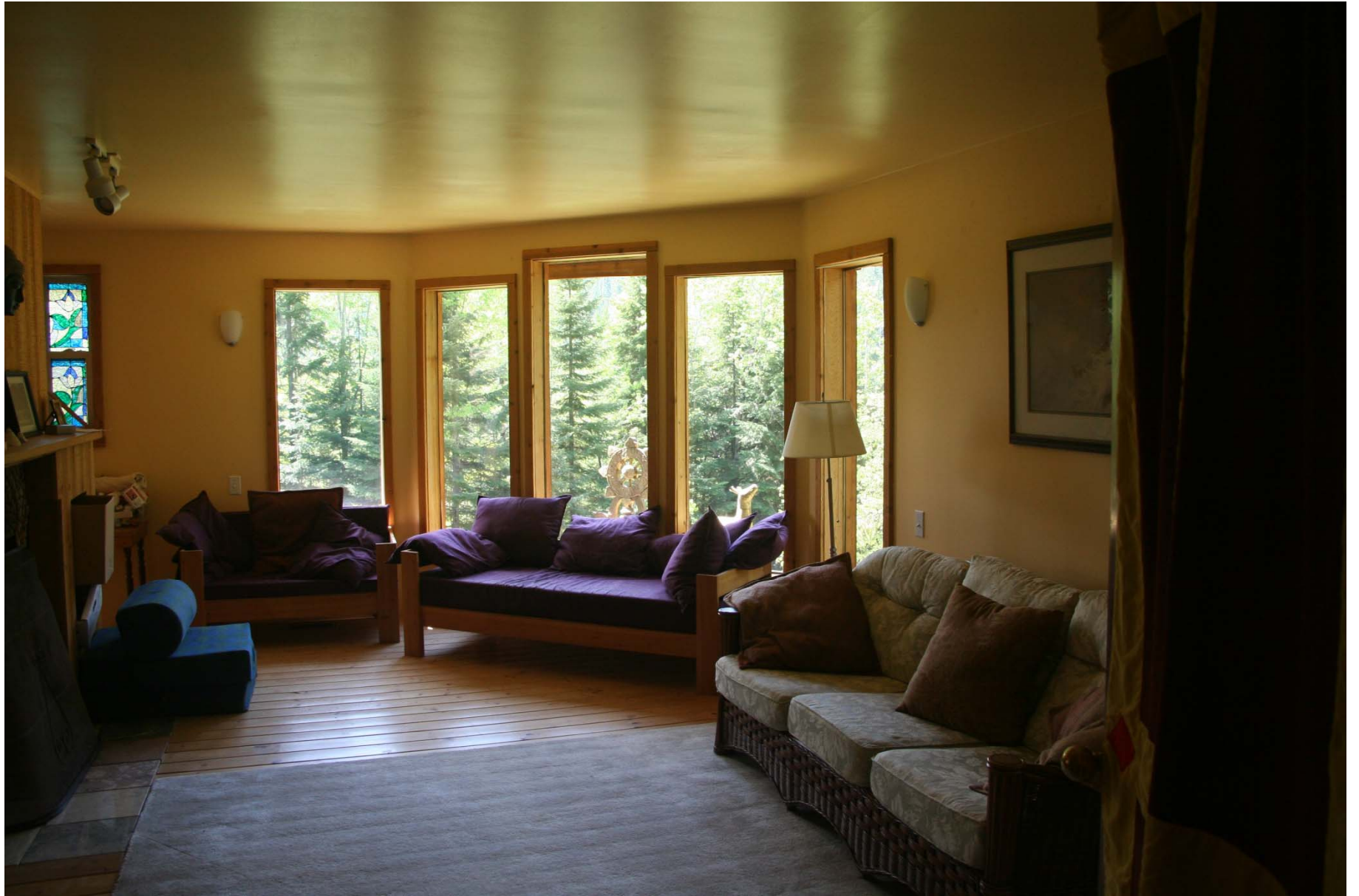
Sitting and meeting room on the second floor with view of Copper Mountain.