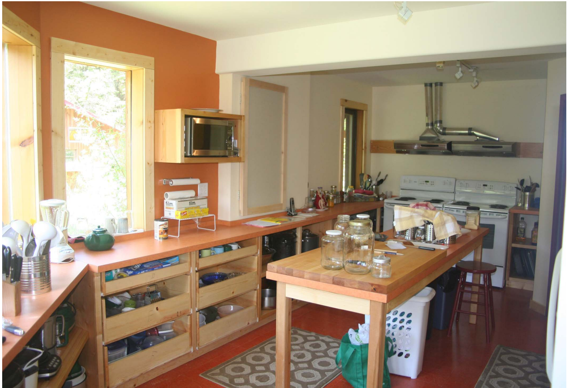
View of the kitchen from outside wall, new stoves, new pull out drawers & open shelving.