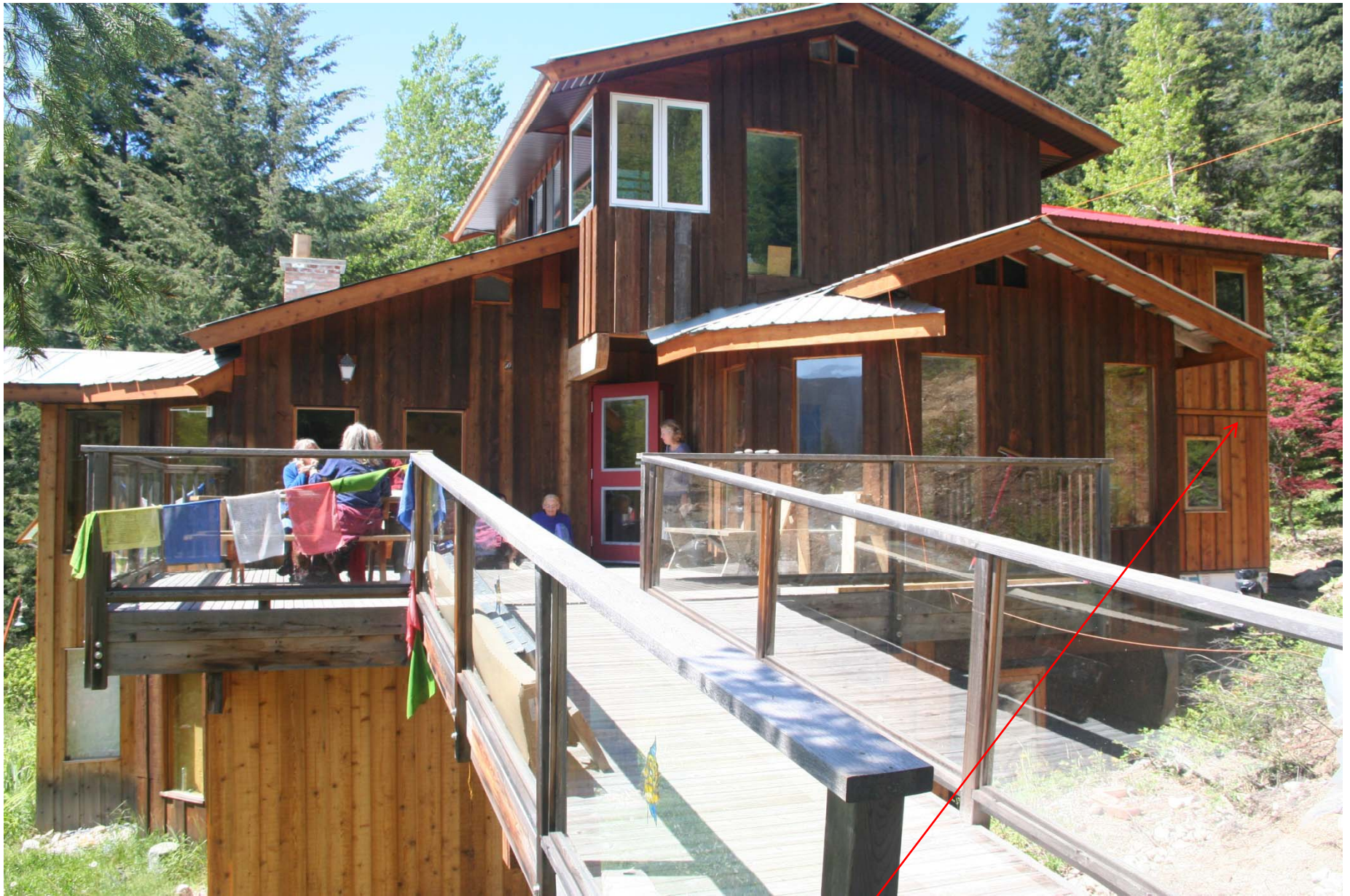
View of Gompa from Tantric temple. Dormitory can be seen on right.