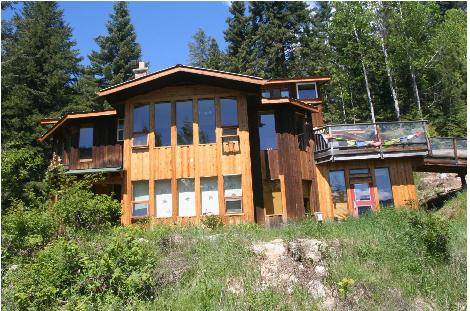
Full side view from road showing all three stories