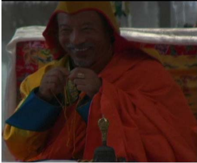
Gompa and Tantric Temple Construction Status, Jan 2011.

The following is a visual update on the construction status of the Gompa and Tantric Temple. The tantric temple is scheduled for completion this year with possible opening ceremony in the early fall. The Gompa construction is largely completed and all commitments under the Building Code and sign off on the building permit occurred last year. There is some final finishing work and updates for disability access yet to be done.