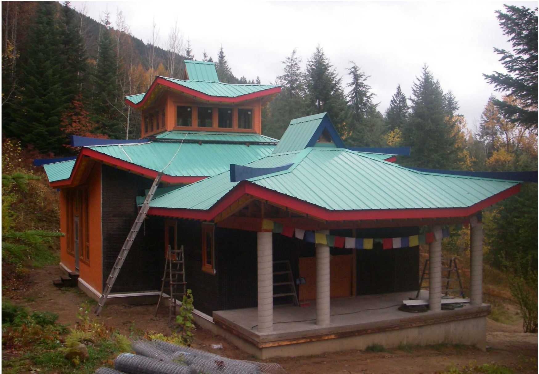
Tantric temple, view from back deck of Gompa, Nov. 2010.