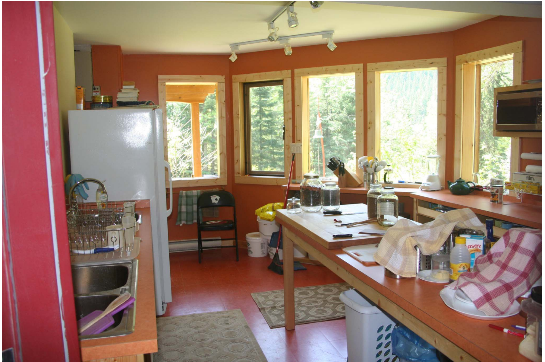
The kitchen was completely renovated last year. View from the entrance.