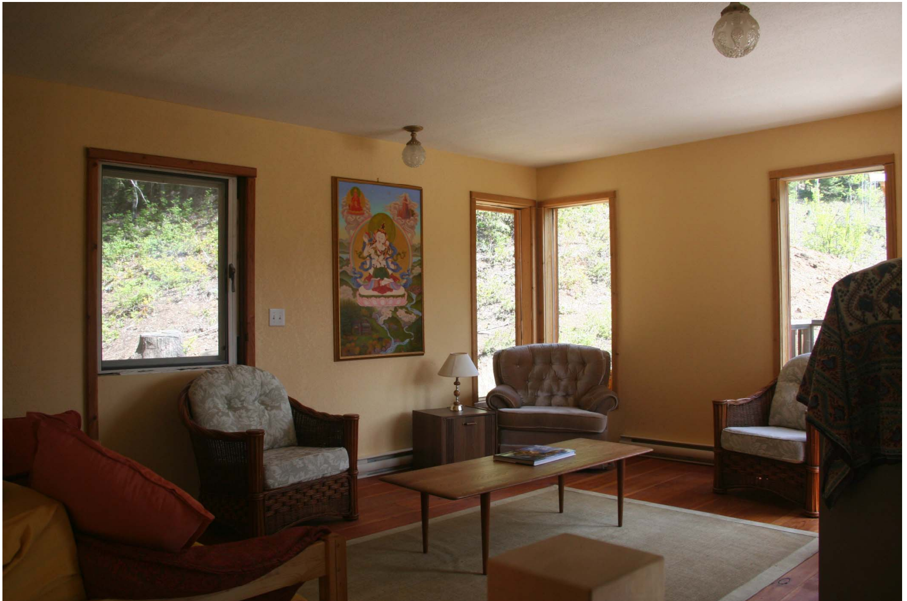
Library was renovated last year.