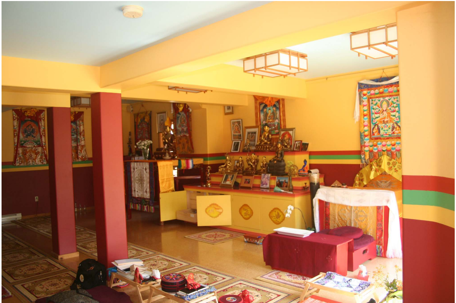
Gompa Shrine Room from outside window. Shrine room renovations completed four years ago.