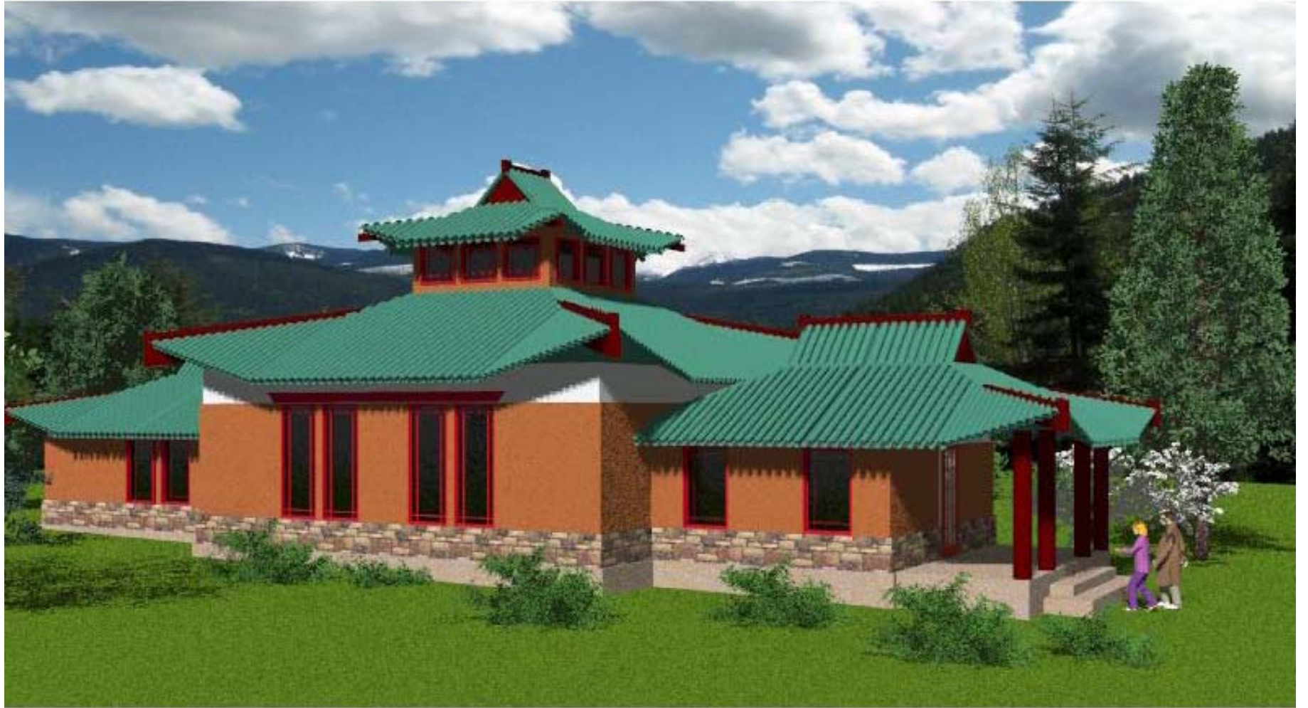
Tantric temple: Architects drawing.