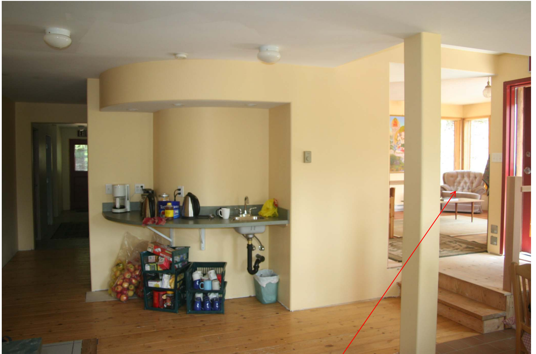
Coffee and tea preparation area on second floor. Renovated library can be seen on right.