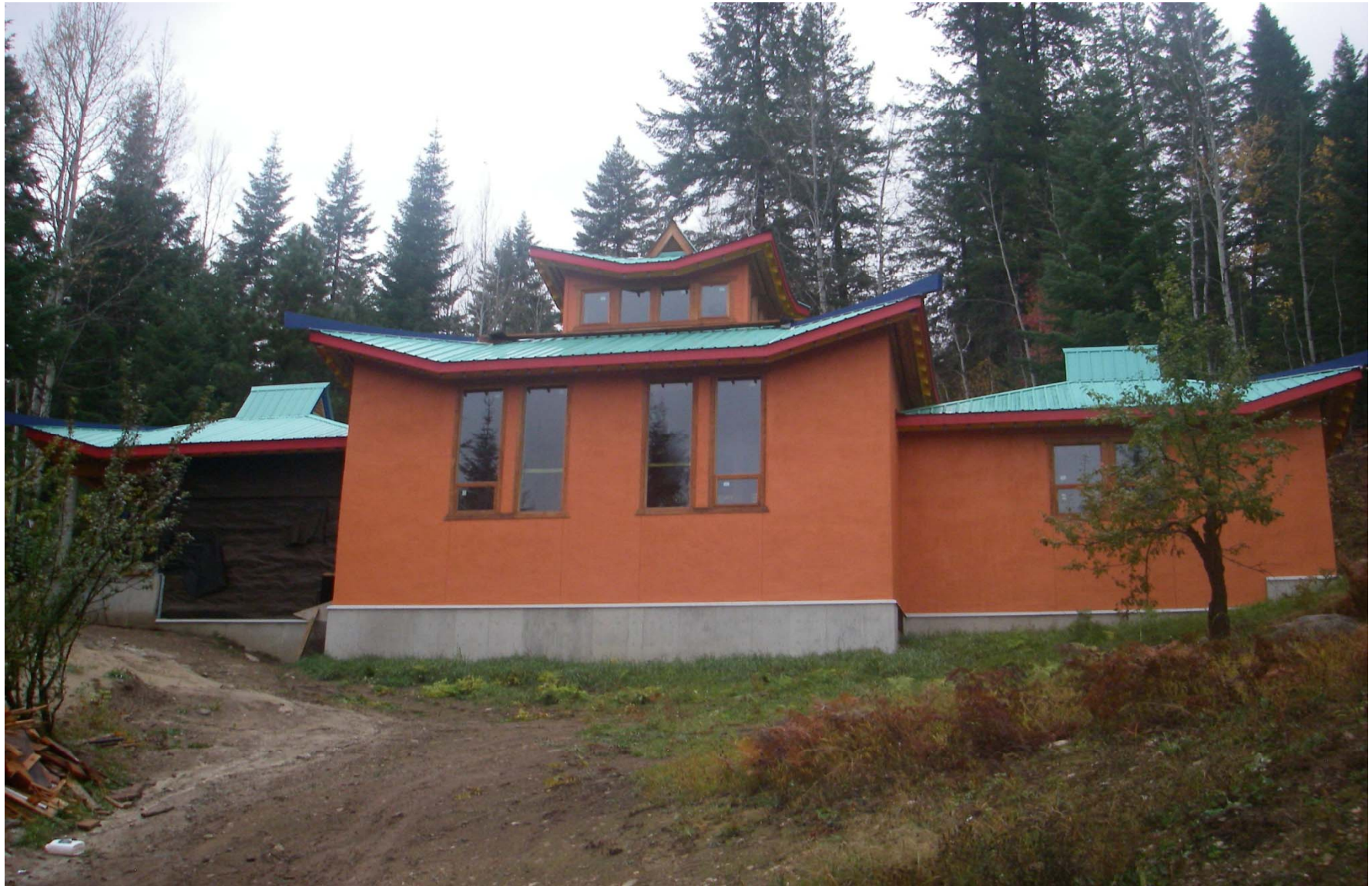
Tantric temple: view from road. Nov. 2010.