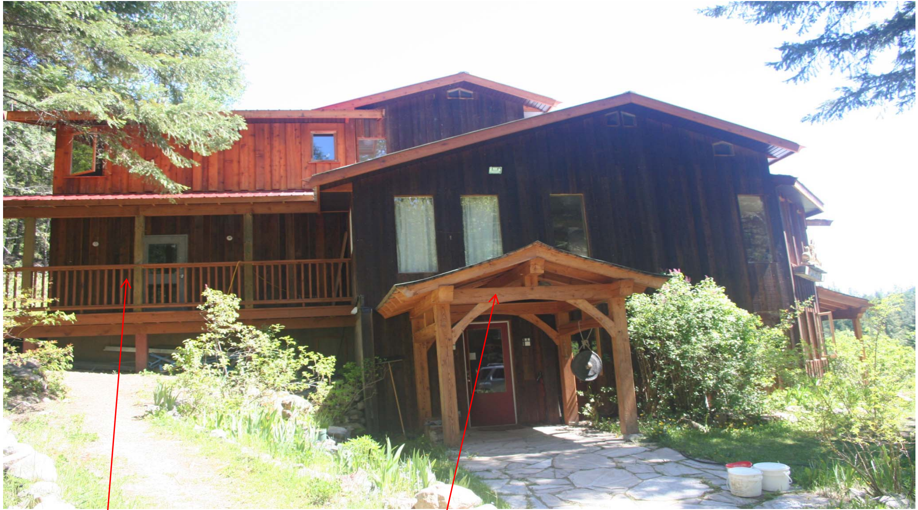
The main entrance to the Gompa. Entranceway is completed. The dormitory on the left with rooms for about 30 and 3 washrooms has been completed.